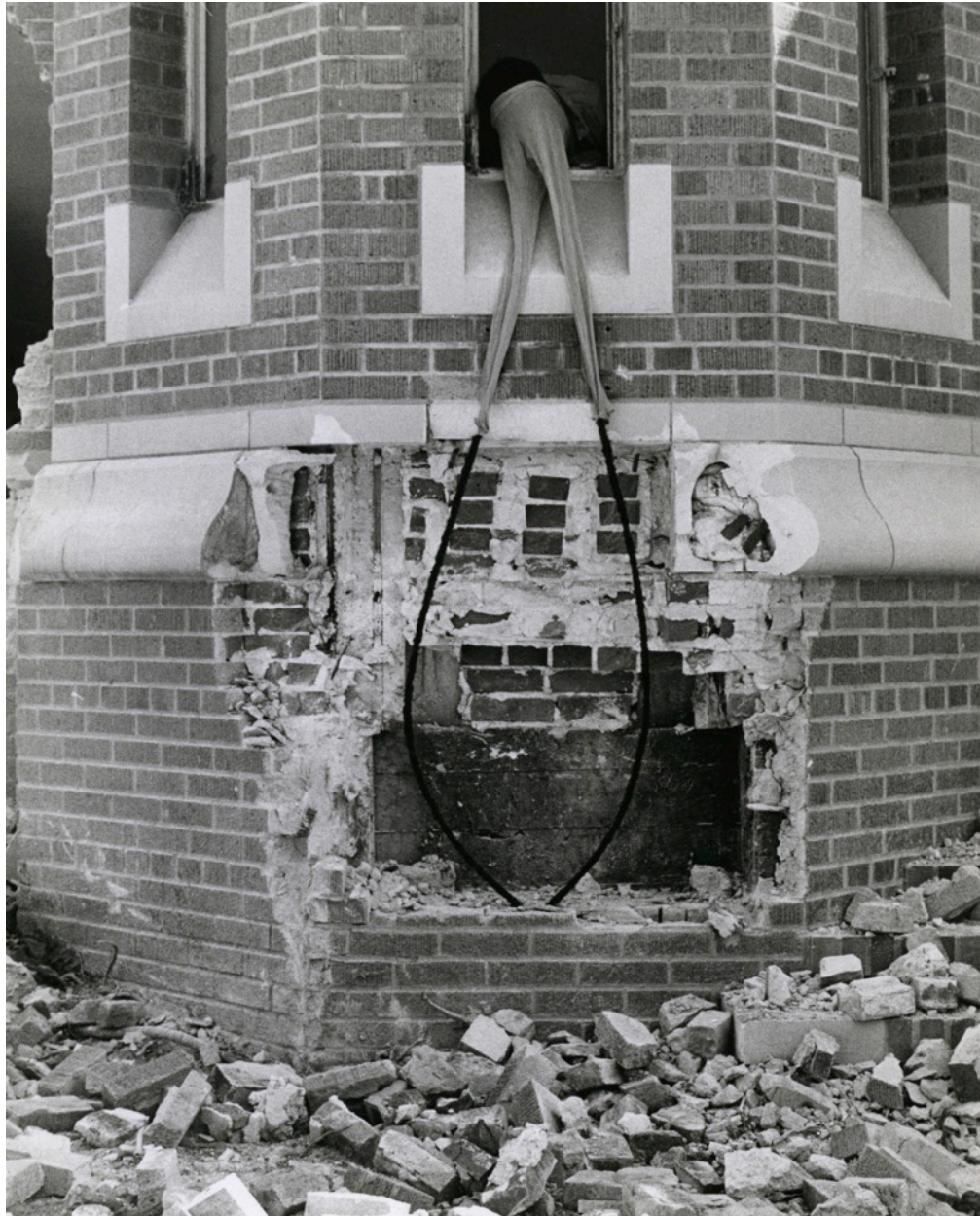
Rapunzel (1981) Silver gelatin print, edition of 5 (+1 AP) 40 x 30 in Photographer: Barbara McCullough