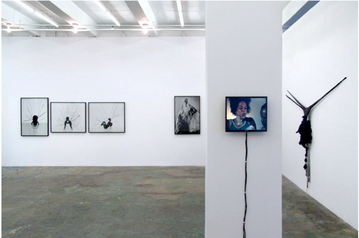
Installation view toward west wall Performances 1976 - 81 January 17 – February 23, 2013 Thomas Erben Gallery