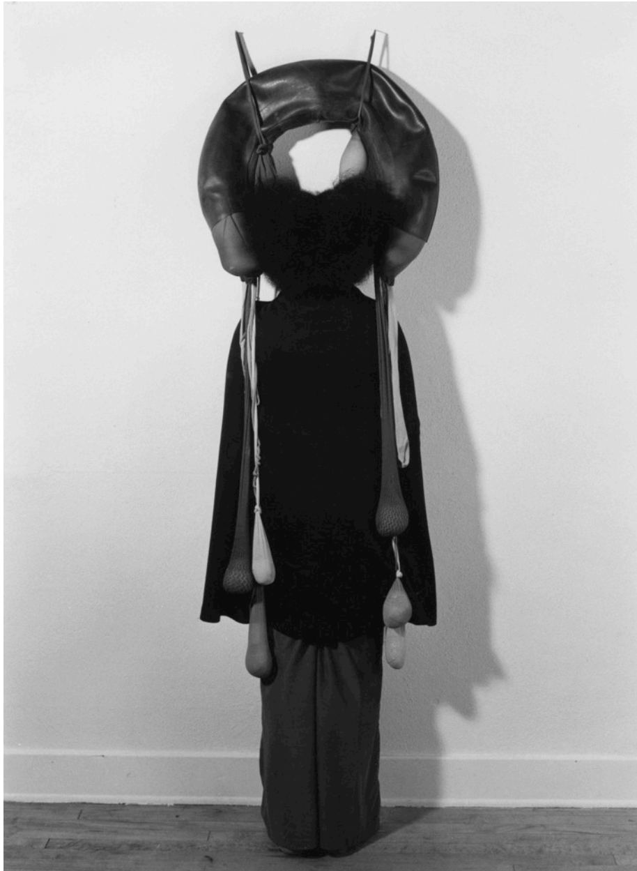
Performance with "Inside/Outside Winter 1977" (1977) Silver gelatin print, edition of 5 (+1 AP) 40 x 30 in