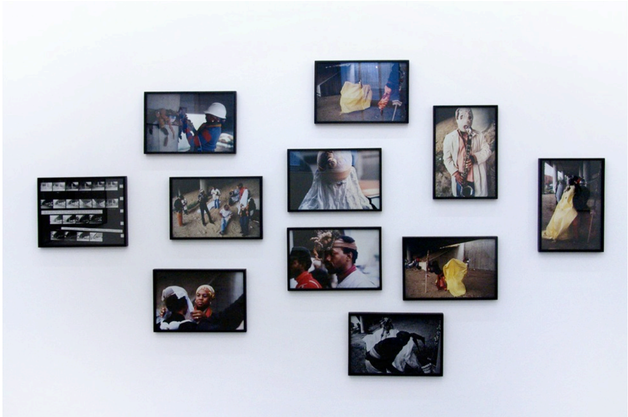
Freeway Fets (1978) C- print, edition of 5 (+1 AP) Series of 11 prints, each 12 x 18 inches Photographer: Quaku / Roderick Young