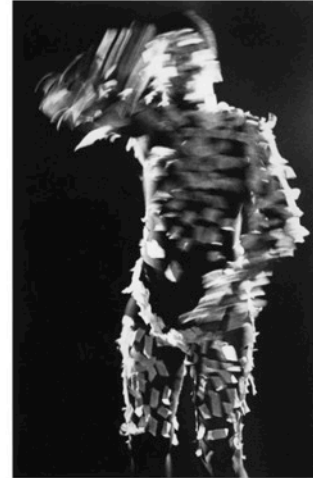
Masked Taping (1978-79) Silver gelatin print, edition of 5 (+1 AP) Triptych, each 40 x 33; 40 x 27; and 40 x 27 inches respectively