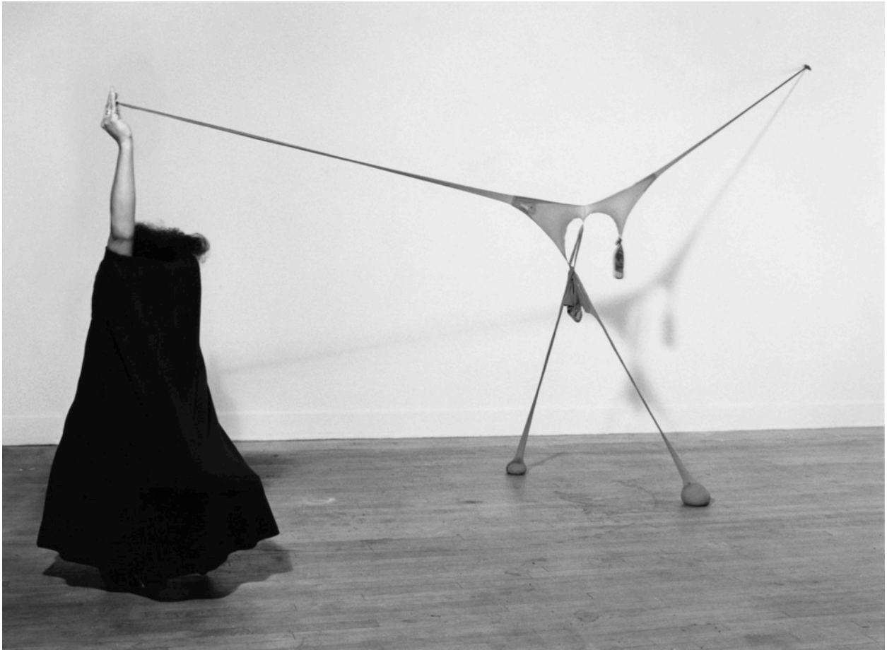
Studio performance with R.S.V.P. (1976) Silver gelatin print, edition of 5 (+1 AP) 30 x 40 in