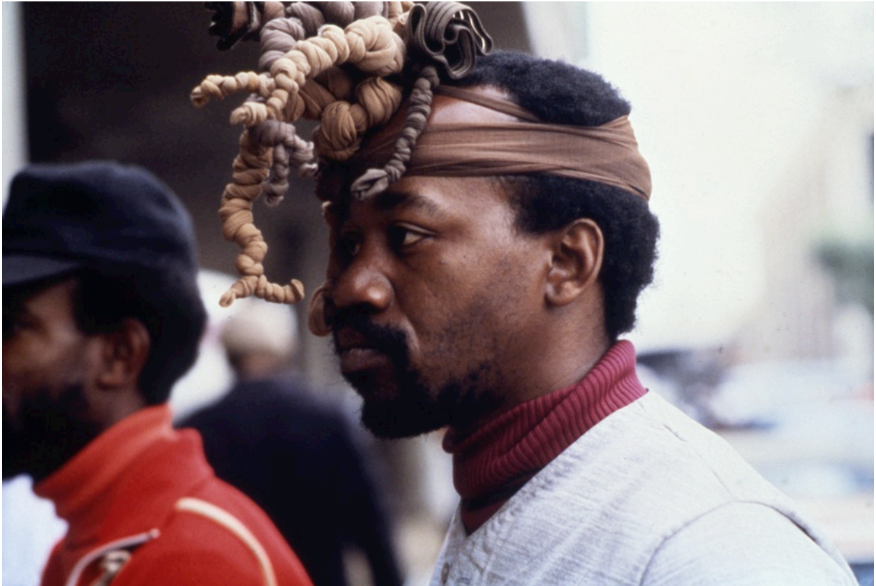
Freeway Fets (1978) C- print, edition of 5 (+1 AP) From series of 11 prints, 12 x 18 inches Photographer: Quaku / Roderick Young