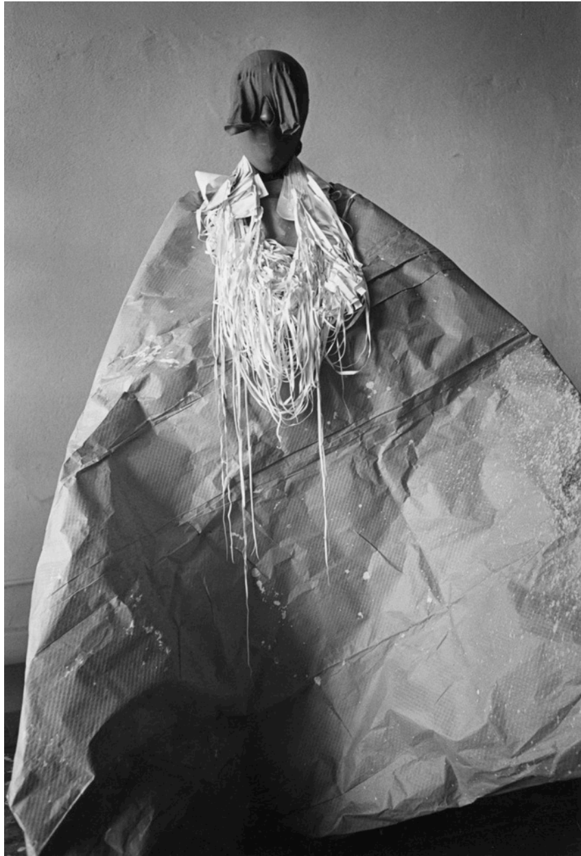
Study for Mesh Mirage (1977) Silver gelatin print, edition of 5 (+1 AP) 40 x 30 in