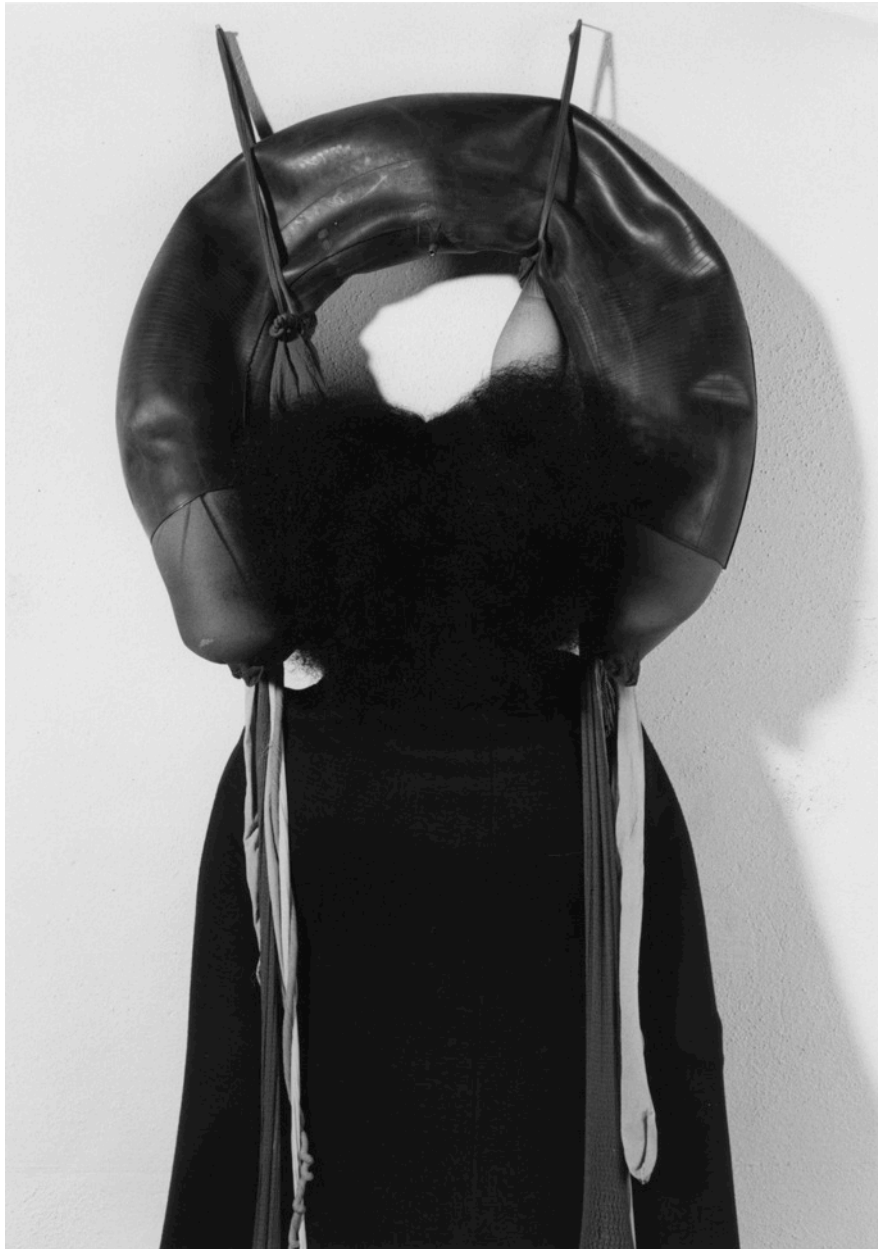
Performance with "Inside/Outside Winter 1977" (1977) Silver gelatin print, edition of 5 (+1 AP) 40 x 30 in