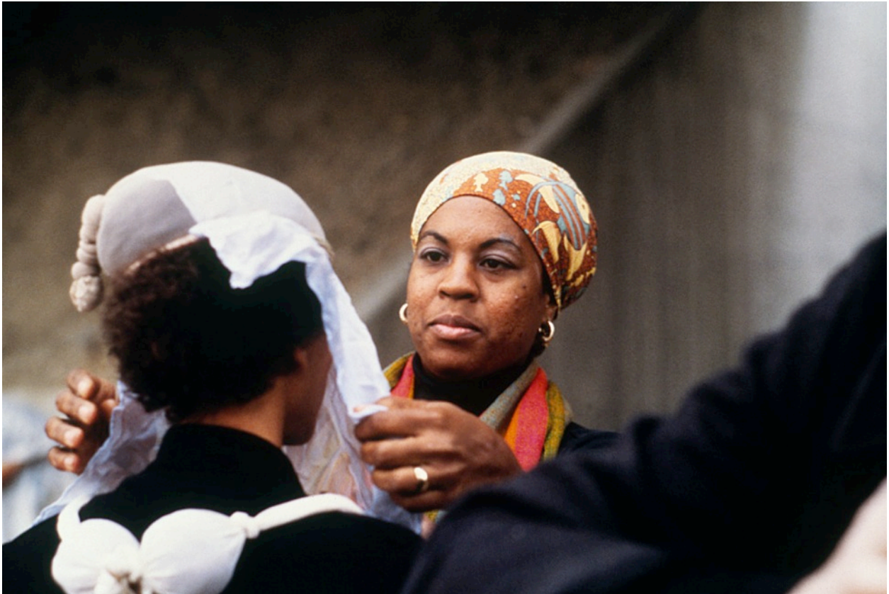
Freeway Fets (1978) C- print, edition of 5 (+1 AP) From series of 11 prints, 12 x 18 inches Photographer: Quaku / Roderick Young