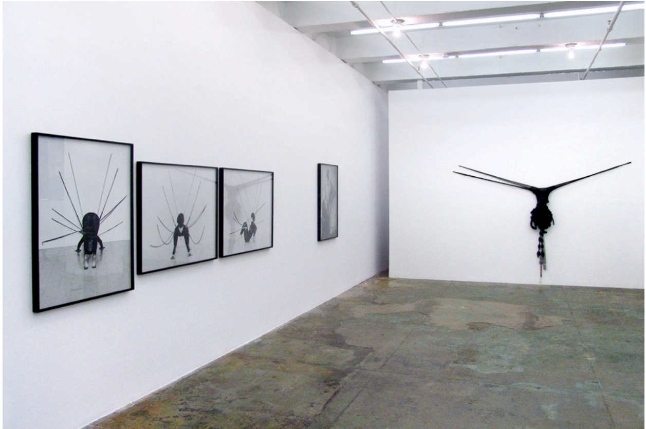
Installation view, west and north wall Performances 1976 - 81 January 17 - February 23, 2013 Thomas Erben Gallery