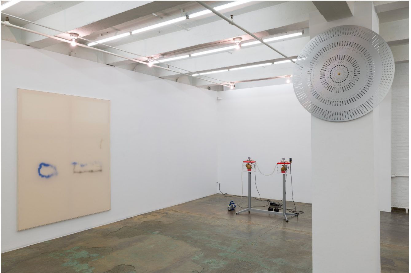
Installation view, north/west walls.