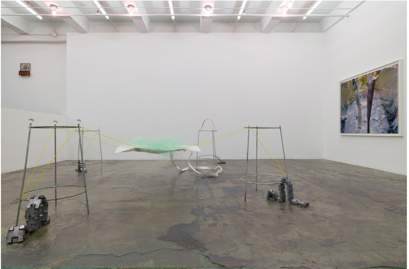
Installation view, east/south walls.