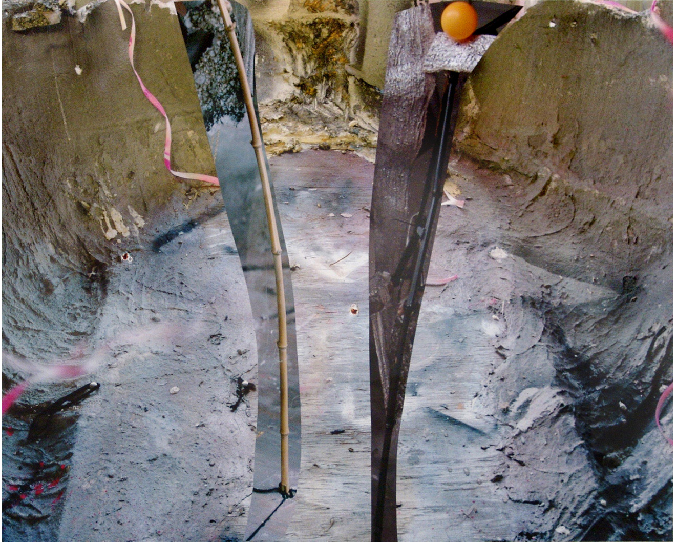
Yamini Nayar Memorious , 2011 C-Print, collage. Edition 2/5 48 × 60 inches