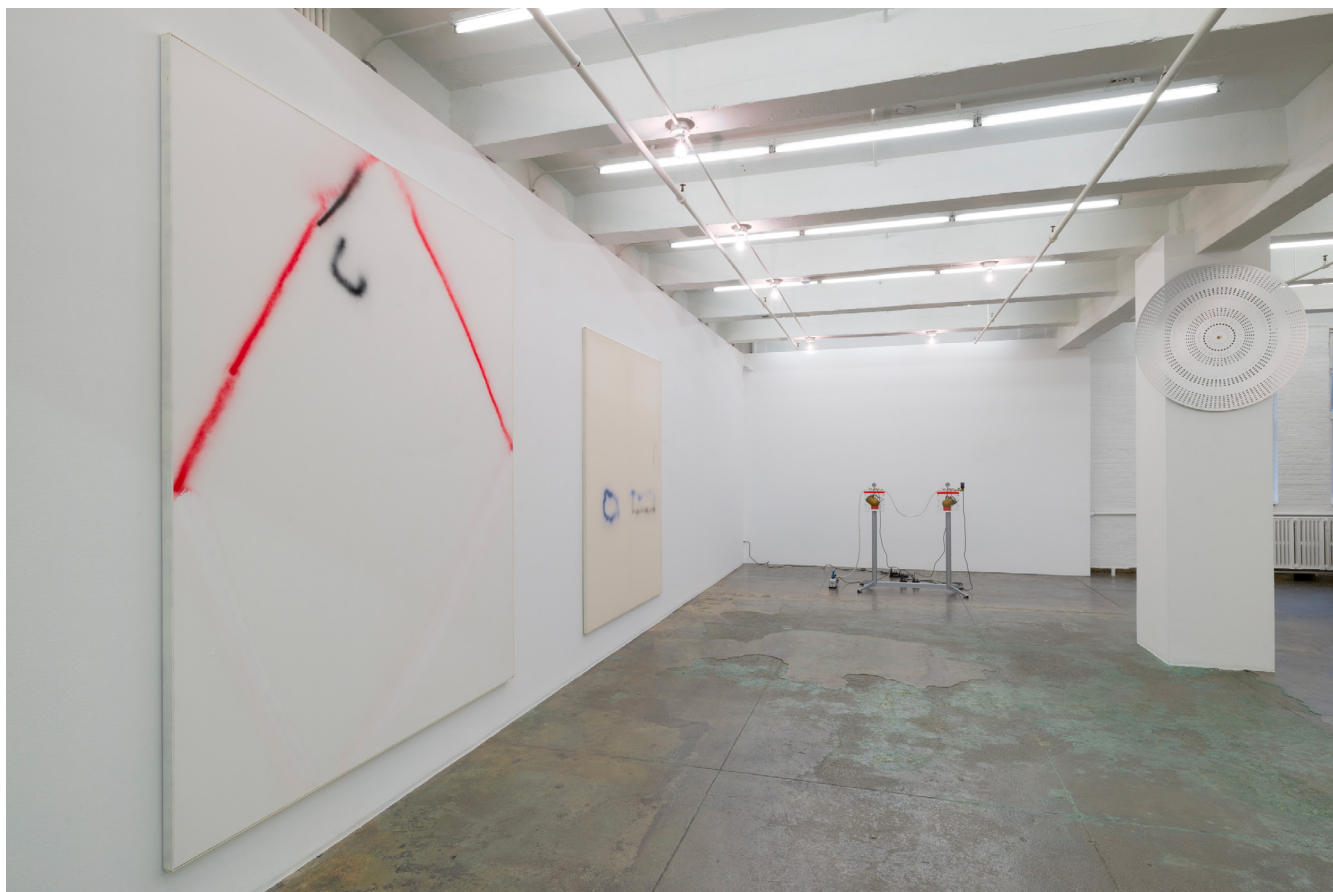
Installation view, north/west walls.