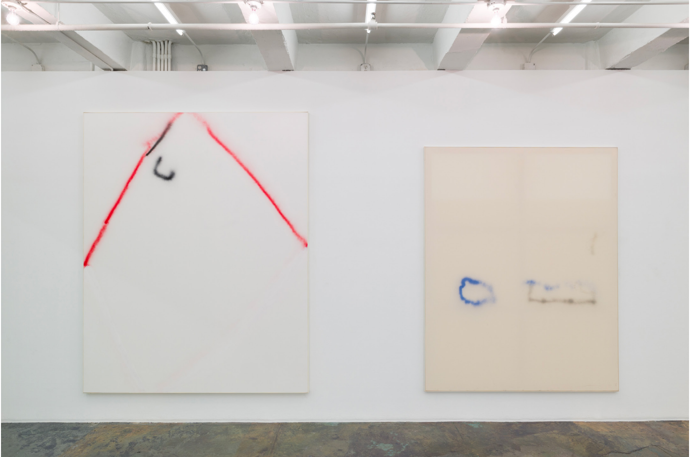
Installation view, west wall.