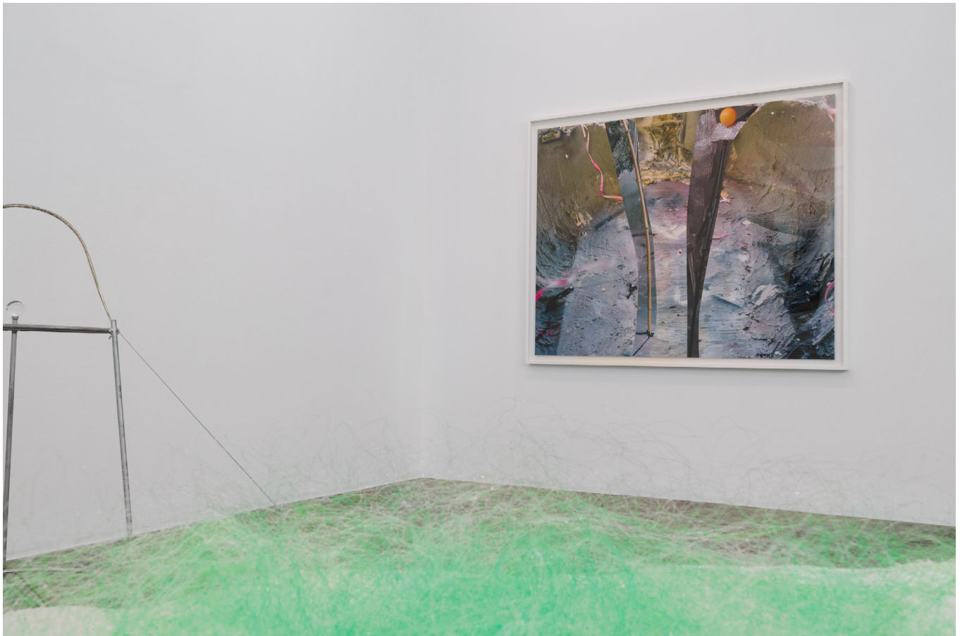
Installation view, south/east walls.