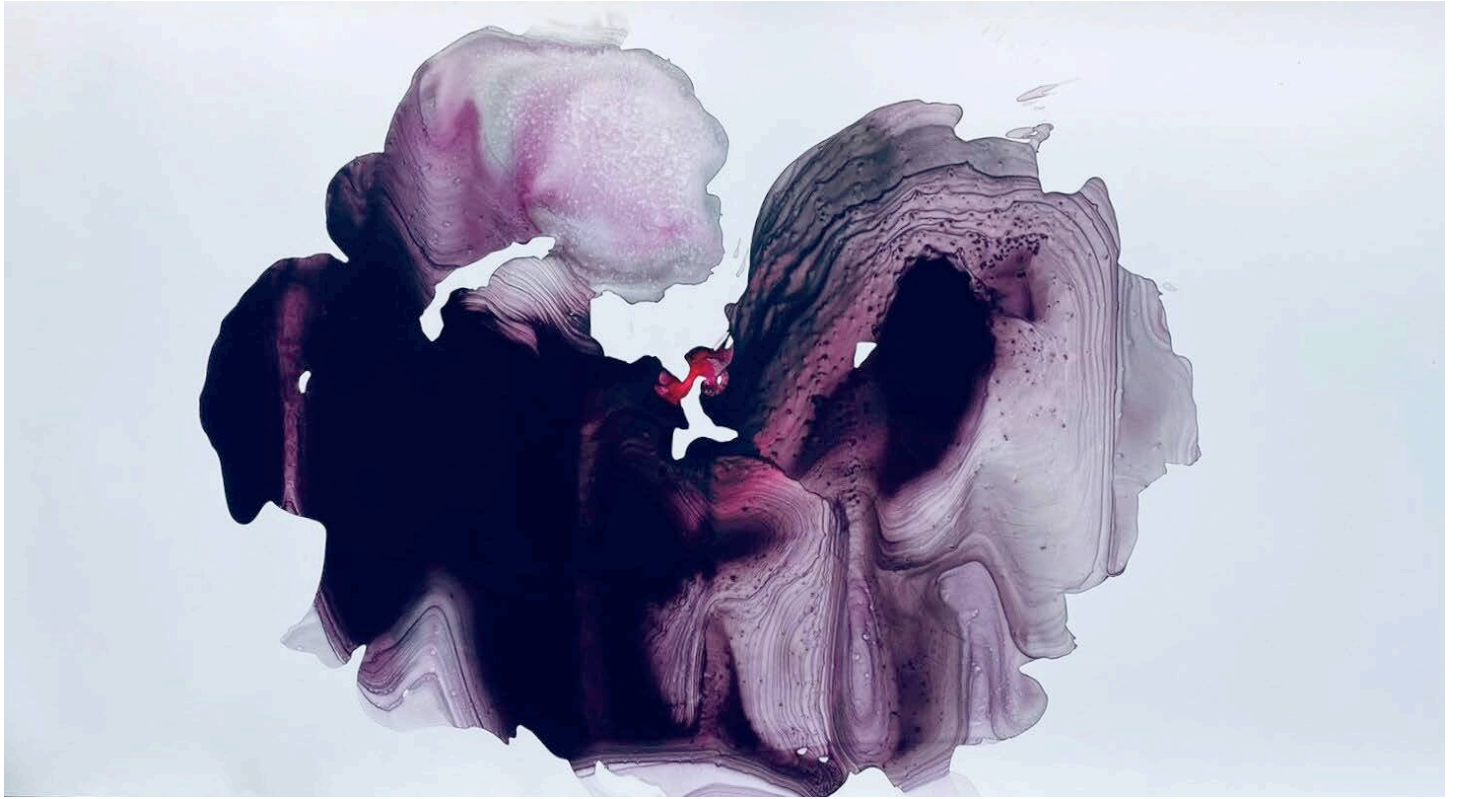
Aditi Singh Seed , 2023 Ink on paper 30 x 69 in. (framed) INR 9 lakhs