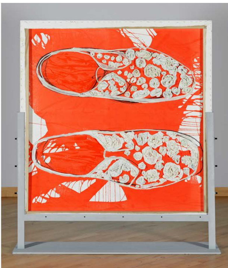
Shoe Painting, 2011 Acrylic and mixed media on canvas (double-sided) 59 × 56 in.