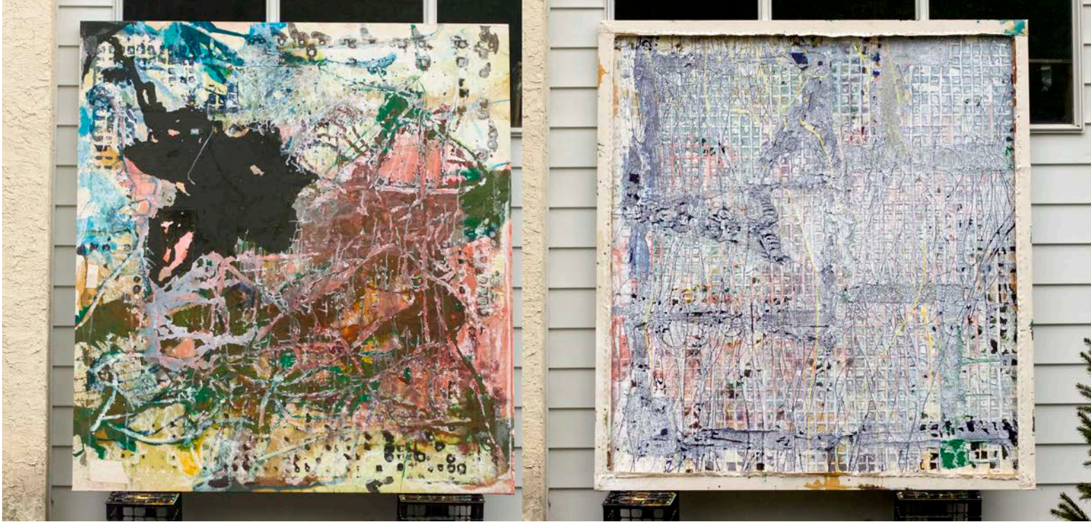
Apollo's Cockroach , 2017

Acrylic and acrylic mediums on canvas (two-sided)