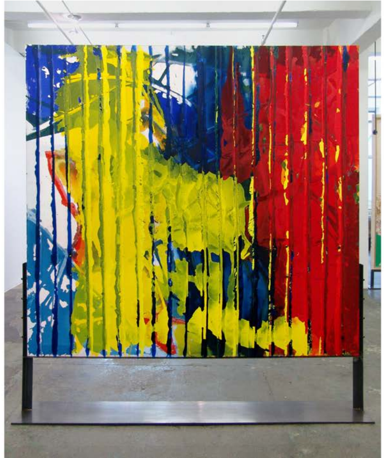
Ribbed Red , 2015 Acrylic and acrylic medium on canvas (two-sided) 83 × 83 in.