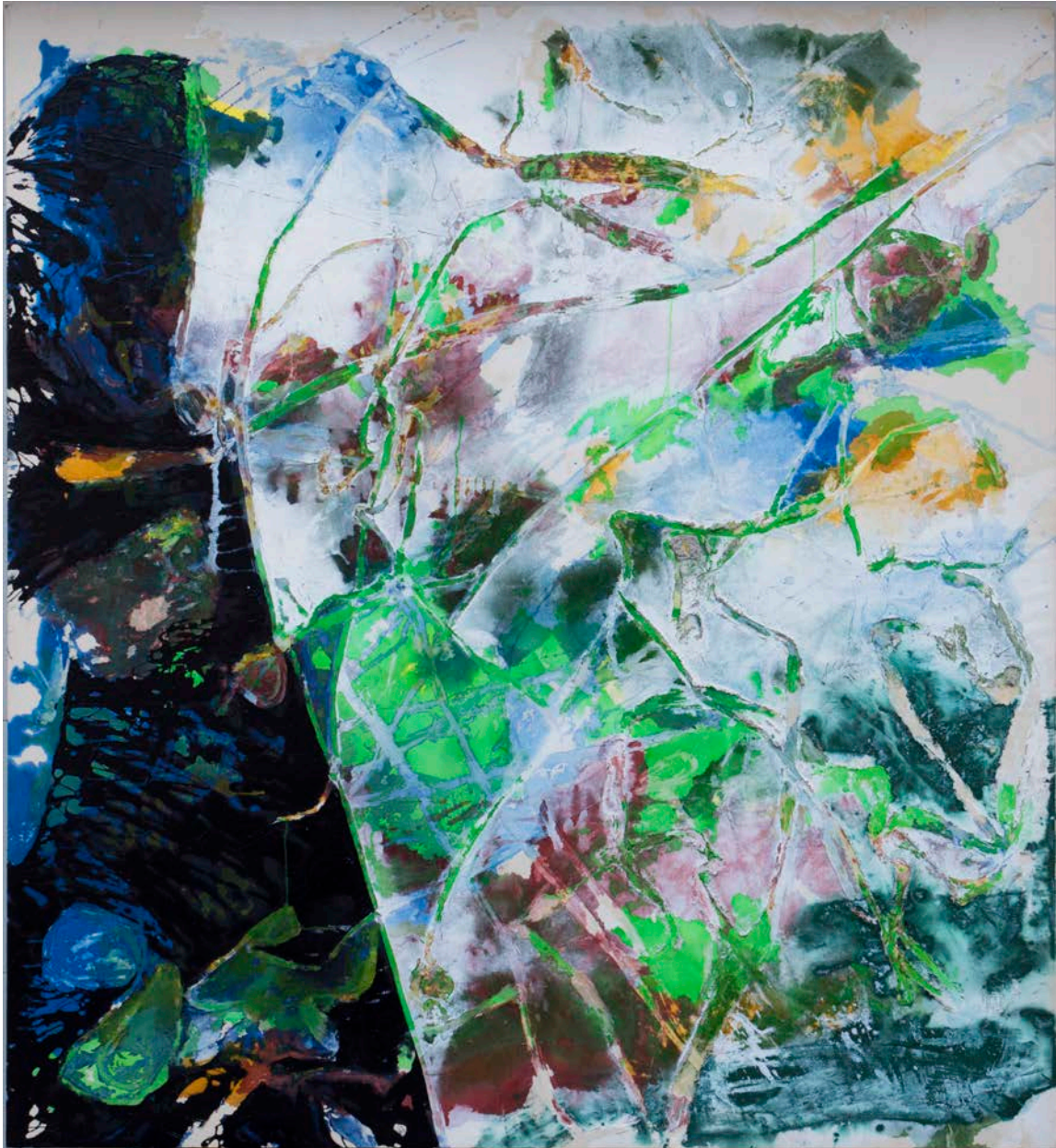
Magdalena Lane, 2016 Acrylic and acrylic mediums on canvas 93 x 84.5 in.