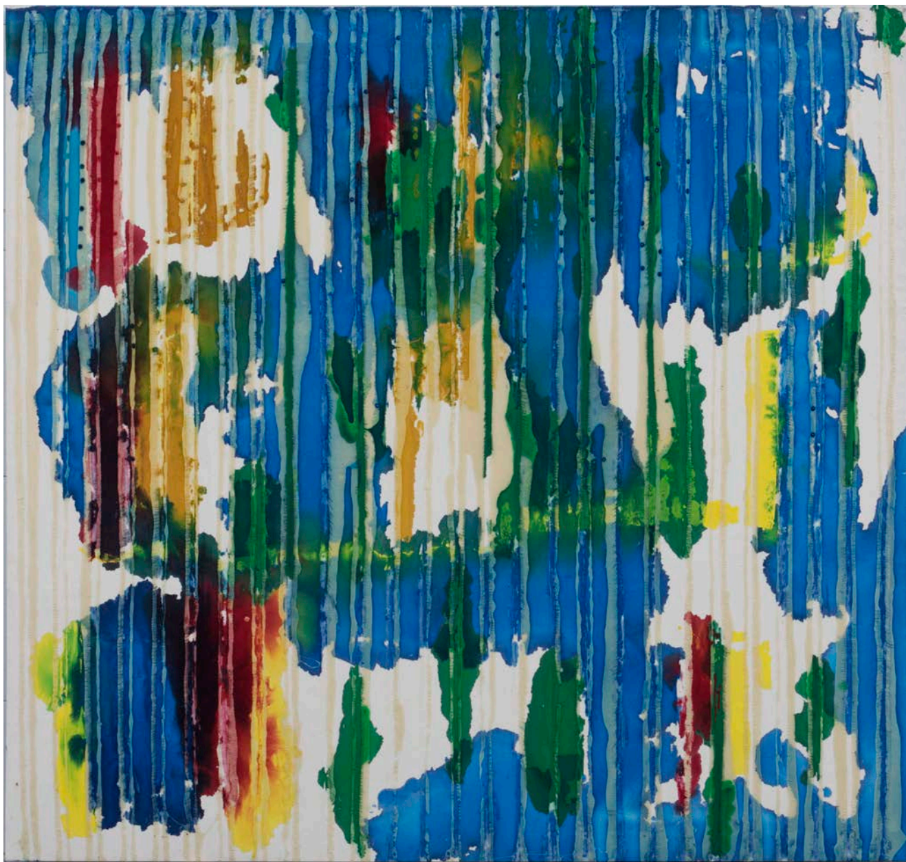
309, 2017 Acrylic and acrylic medium on canvas 79 × 83 in.