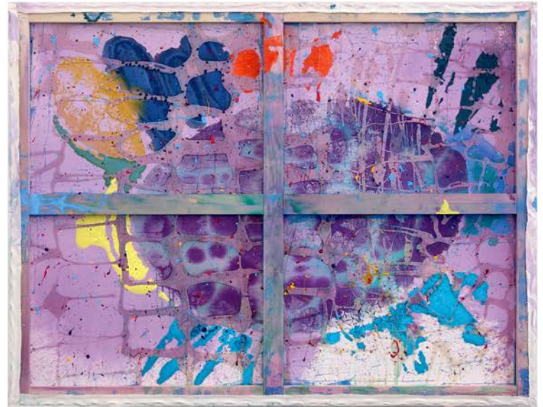
Birdy , 2015 Acrylic and acrylic medium on canvas (two-sided) 61 × 79.25 in.