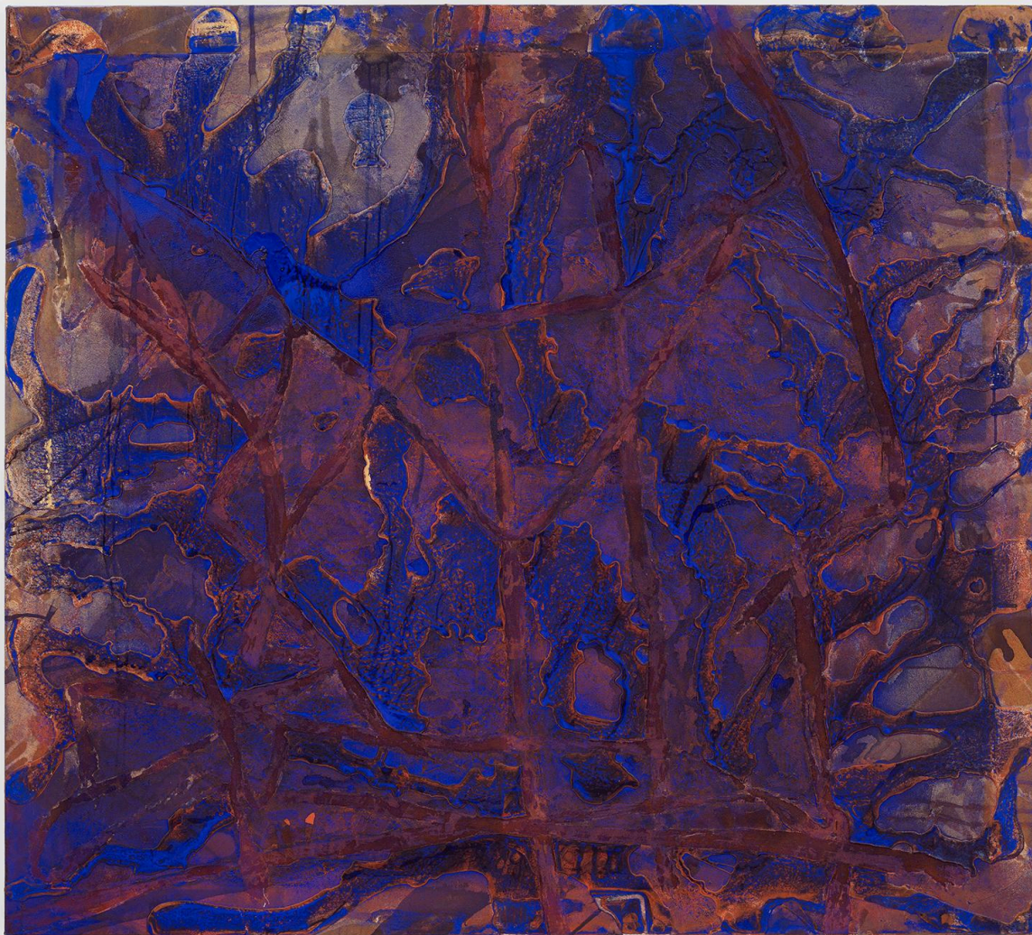
Dona Nelson , Crosstown Lights , 2025. Acrylic paint and mediums on canvas 54 ½ × 60 ½ in.