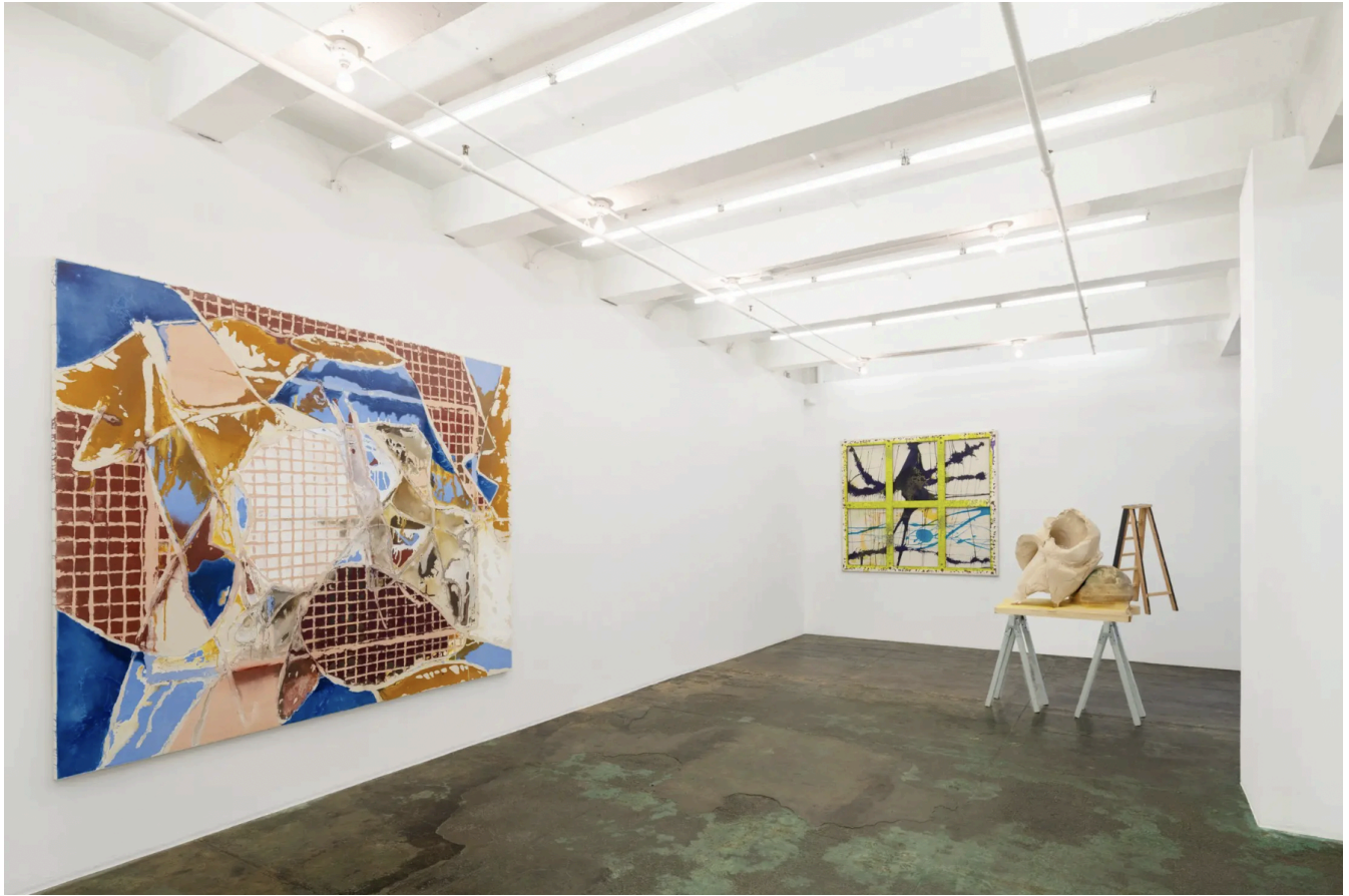
Installation view at Thomas Erben Gallery