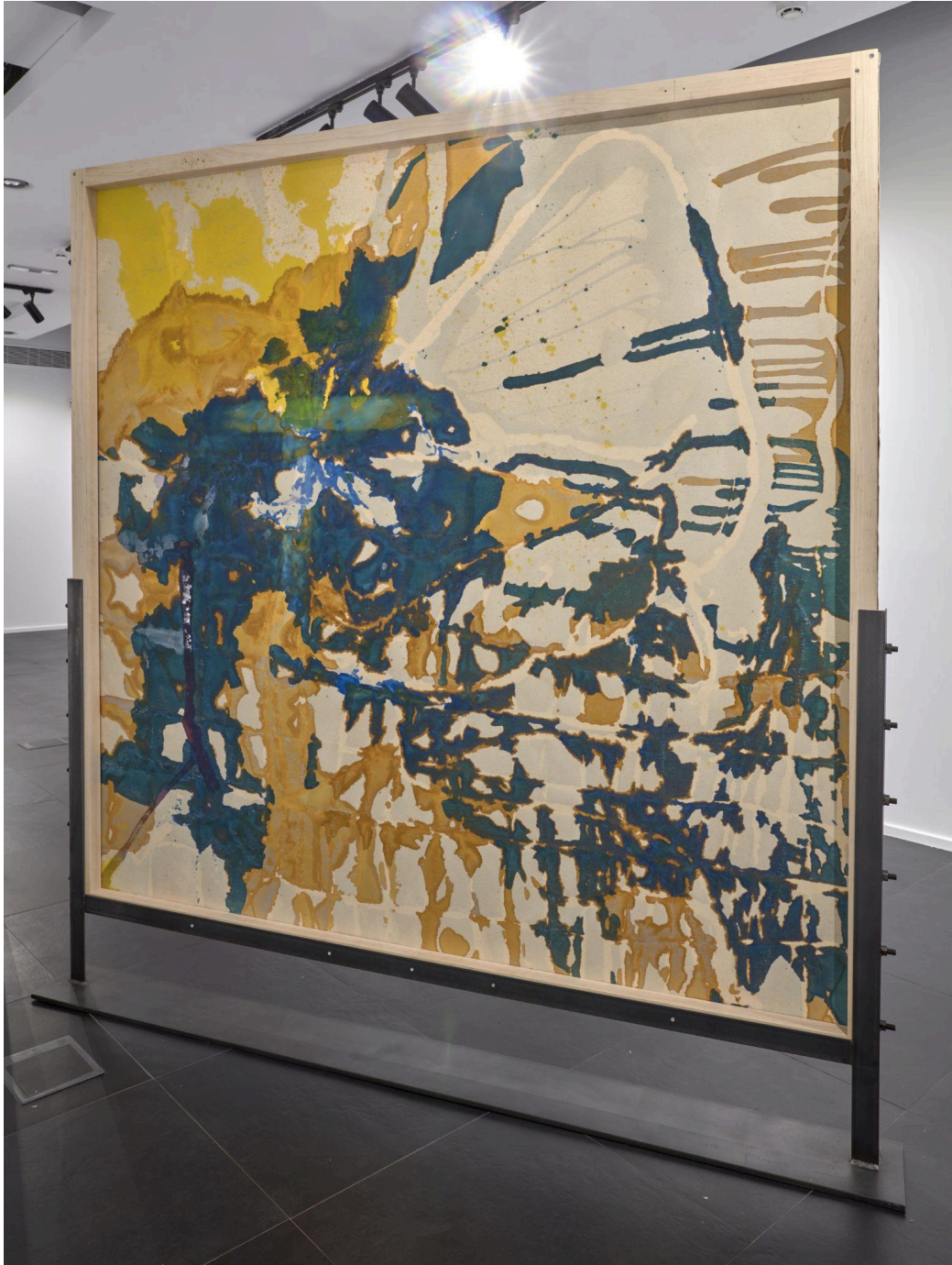
Dona Nelson , Twilight , 2022 (double-sided). Acrylic paint and acrylic mediums on canvas, steel stand 80 × 80 × 2 in.