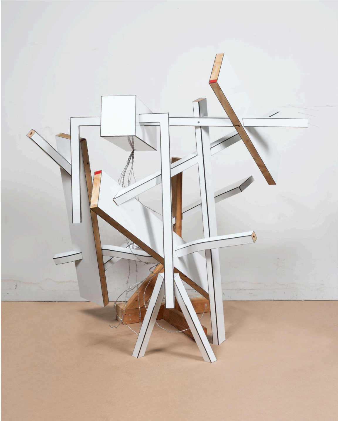
Andrew Ross , Fountain , 2026 (alternate angle). Plywood, wood, dibond, steel and barbed wire 63 x 54 ½ x 46 in.