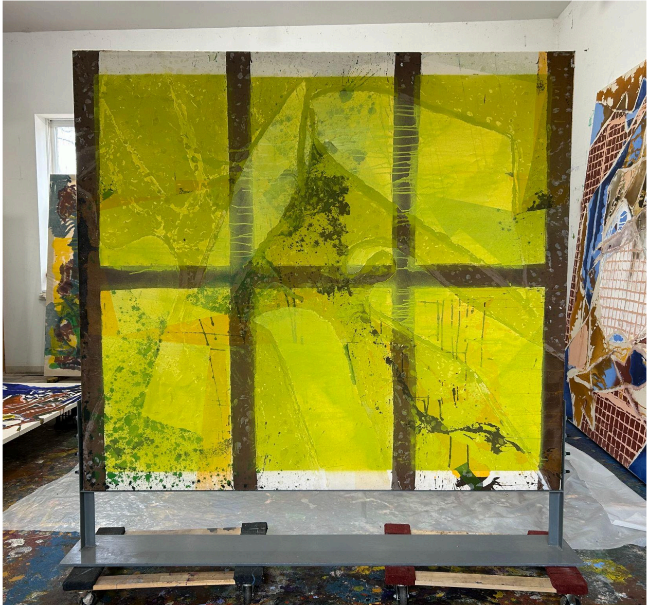
Dona Nelson , Skater , 2024 (double-sided). Acrylic and acrylic mediums on canvas and on a redwood stretcher 70 × 78 in.