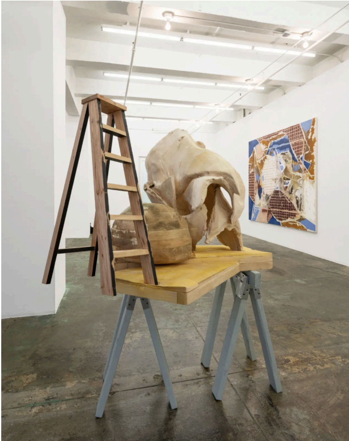
Andrew Ross , Star-Link , 2025 (alternate angle). Basswood, douglas fir, pigment, lacquer 40 x 52 x 43 in.