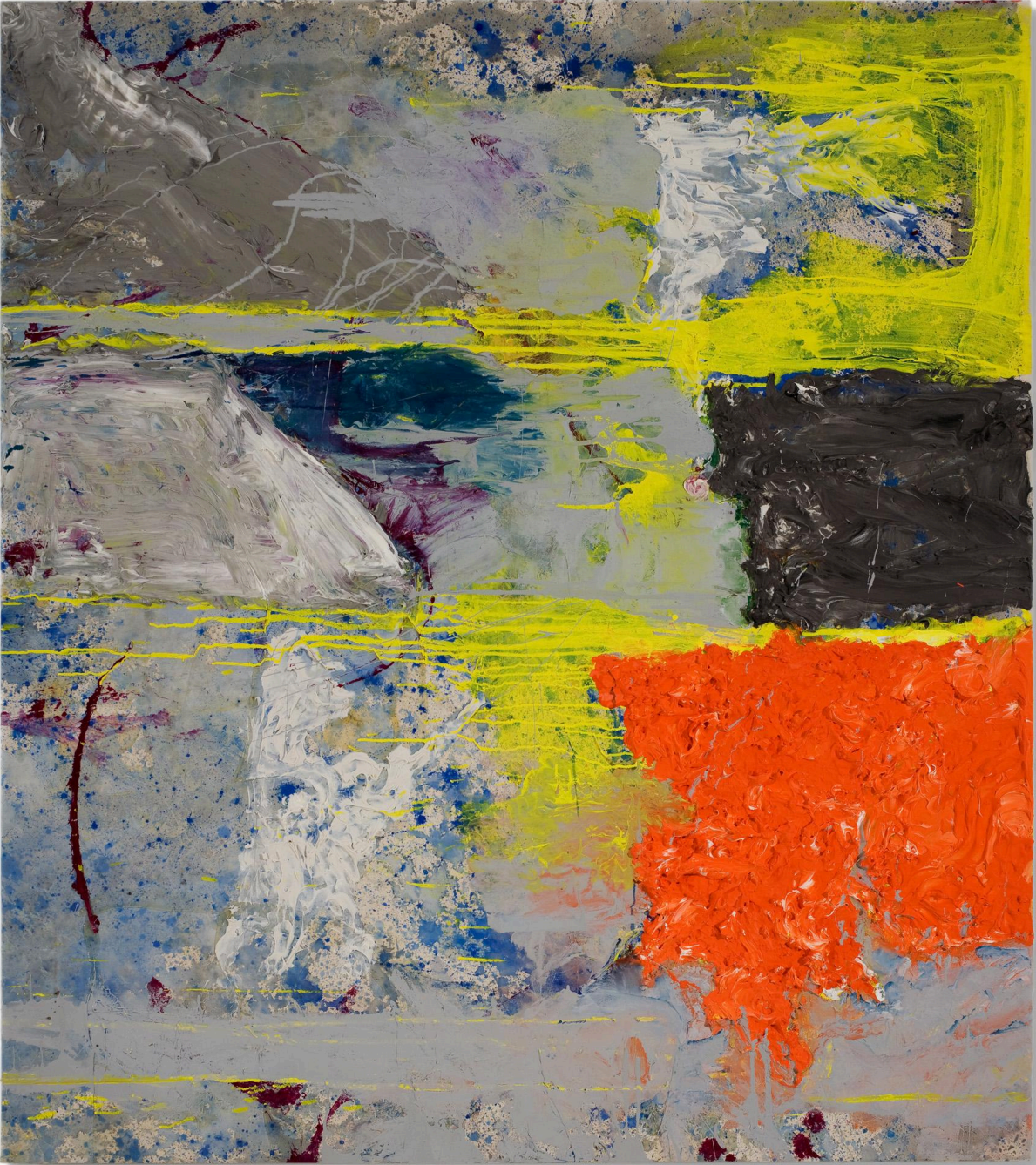
Dona Nelson , Line Street , 2007. Acrylic and acrylic medium on canvas 79 × 70 in.