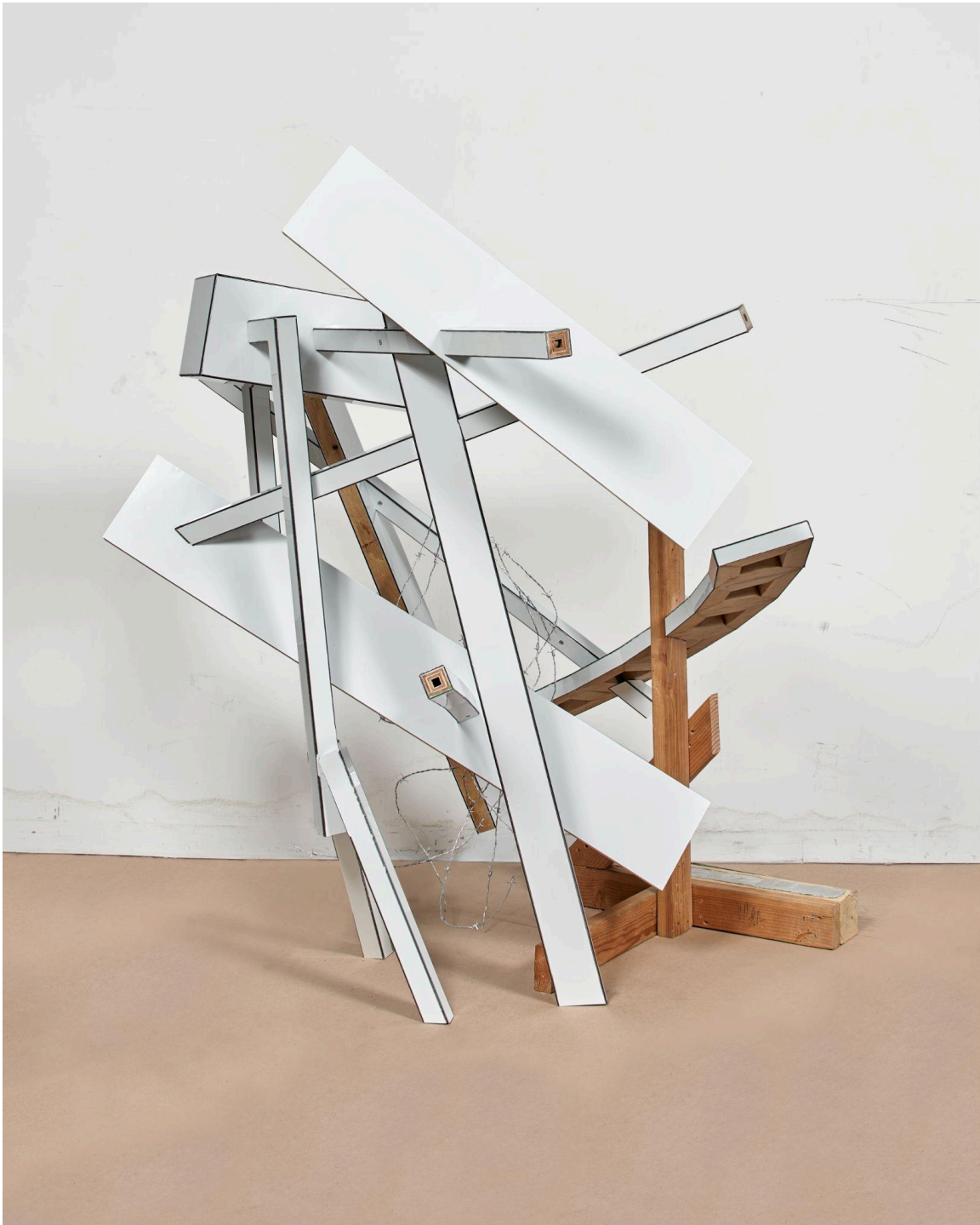
Andrew Ross , Fountain , 2026. Plywood, wood, dibond, steel and barbed wire 63 x 54 ½ x 46 in.