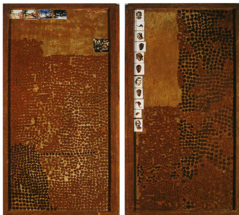
Sheela Gowda. Private Gallery. Installation. 2 panels: 78" x 42" x 1.5" each + a set of watercolour paintings. Ply board and wood, lamination sheet, cow dung, watercolour on paper. 1999.