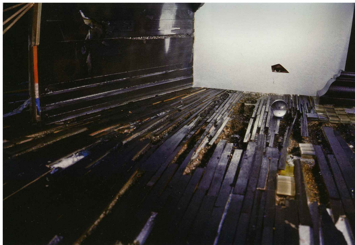
Yamini Nayar. Cleo . C-print. 30" x 40". Edition of 5 (+2 AP). 2009.