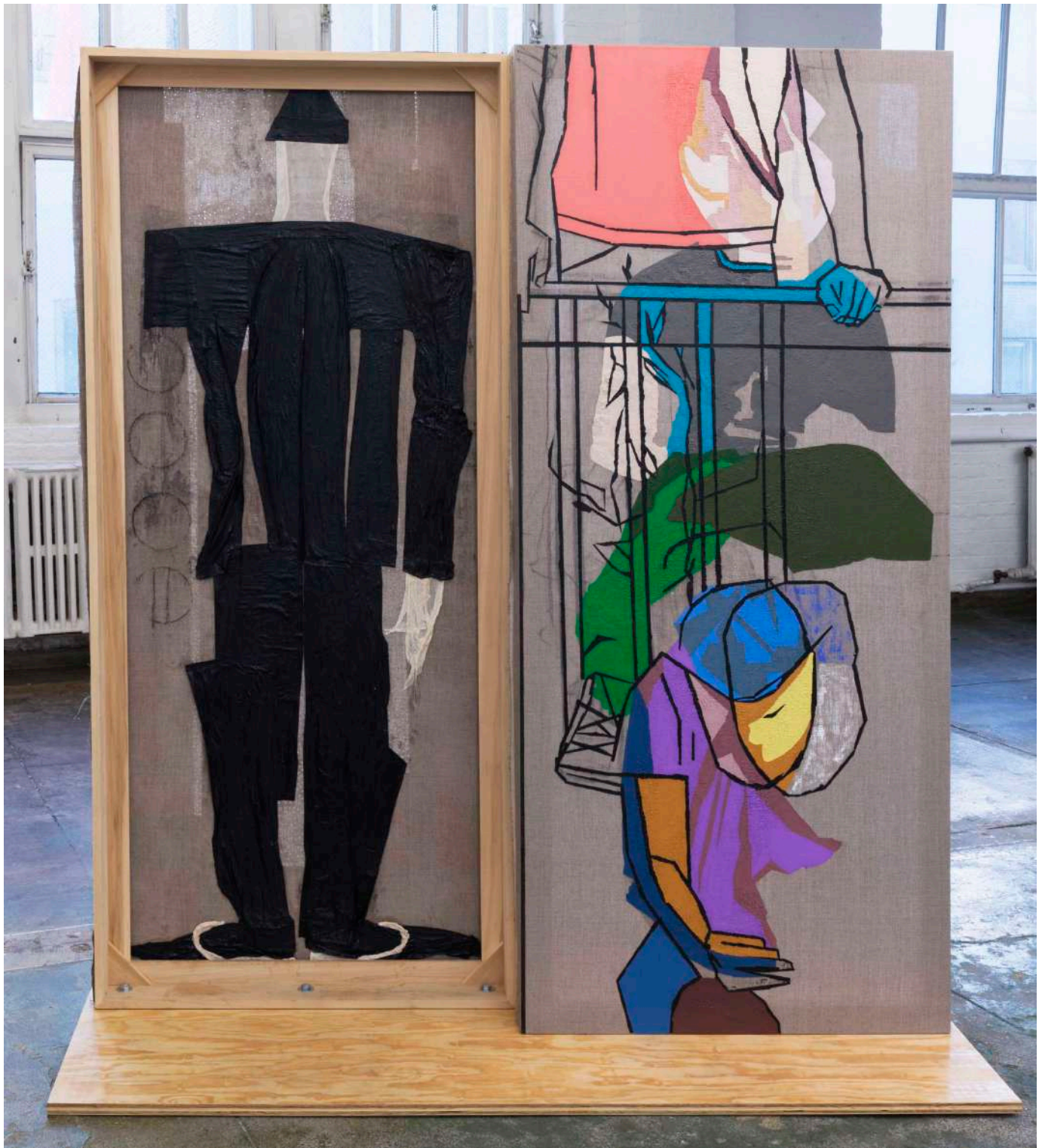
Dona Nelson, "Platform" (2017), collage, dyed cheesecloth, muslin, and acrylic on linen mounted on plywood base, 81.5 x 36 in.; base: 74 x 22 in.