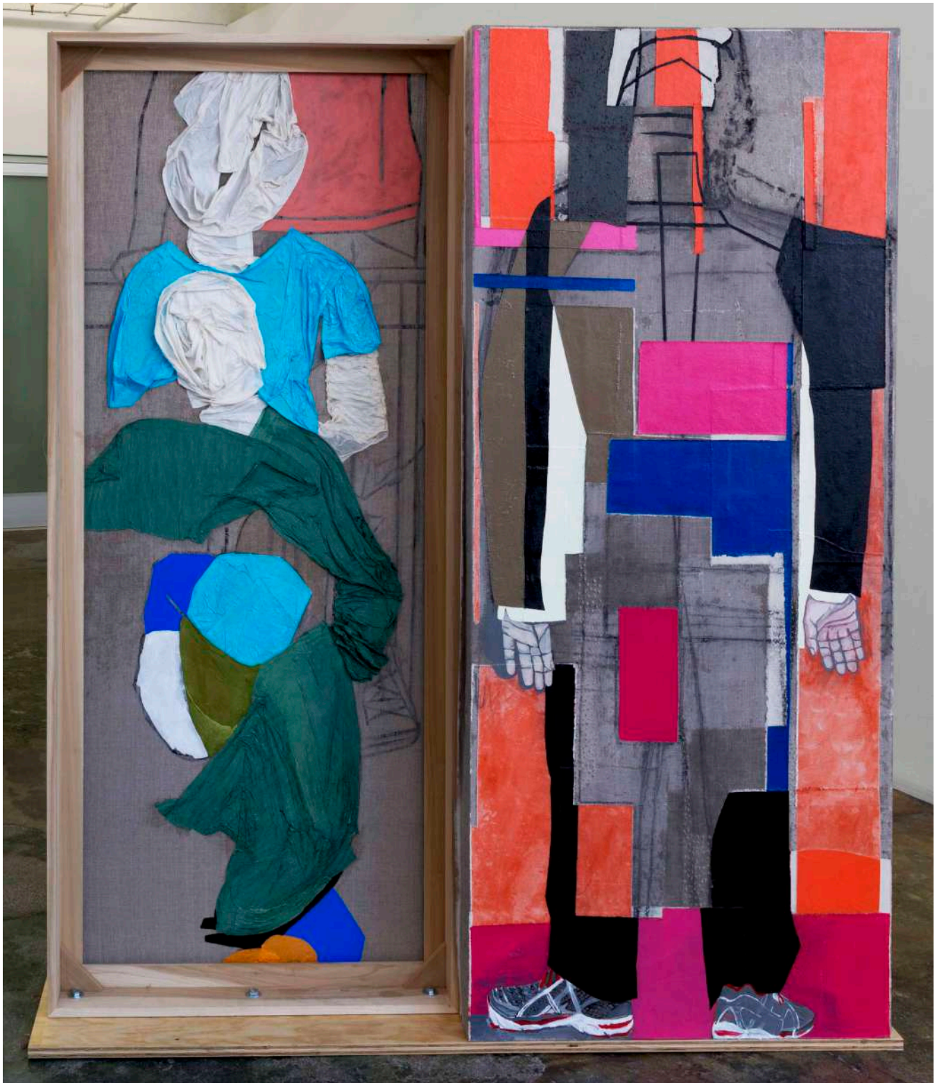
Dona Nelson, "Platform" (2017), (reverse side), collage, dyed cheesecloth, muslin, and acrylic on linen mounted on plywood base, 81.5 x 36 in.; base: 74 x 22 in.

The exhibit includes an embedded Youtube video of the artist talking about the work. In it, she says she likes the mix of illusion