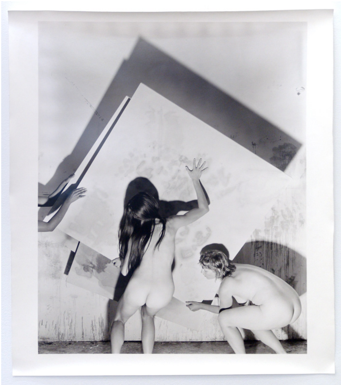
Nudes Moving an Abstract Painting 3 , 2013. Silver gelatin print, part of triptych, edition of 5 (+2 AP), 25 x 20 in.