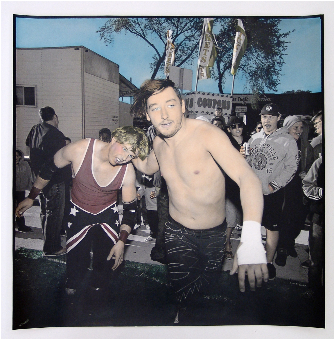
Cona , 2013. Hand-tinted silver gelatin print, edition of 5 (+2 AP), 29.75 x 29.75 in.

The display of snapshot-style documentary material side by side with overtly staged scenes – where the peculiarity of the latter makes us question the truthfulness of the former – casts a shadow of unreality over the entire exhibition. Paradoxically, as many of the photographs are so obviously constructed performances, it is difficult to read them as anything but an accurate documentation of exactly what the artist wants to show us. By crafting scenes as peculiar as these, and using a technique that emphasizes materiality and presents each print as an object in itself, Stocki may have found the only way for a photograph to truly and objectively represent its subject matter.