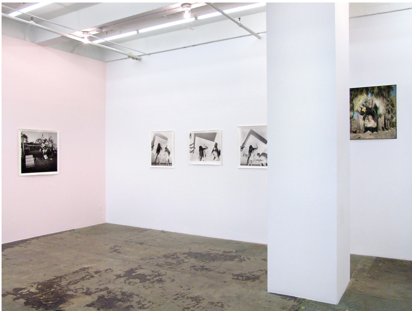
Installation view: east and south wall.

This becomes especially apparent in the triptych Nudes Moving an Abstract Painting , where three women, as directed by Stocki, maneuver a painting made by the artist in front of her own paint-stained studio wall (referencing, among other things, Yves Klein's nude model painting performances). The stark contrast between light and animate shadows, the sensuality of the bodies and their outlines set against angular planes, and the perfectly uncomfortable cropping where a tiny sliver of an object may hover right at the edge, all generate a high degree of formal complexity. Combined with intricately composed documentary images like Ellice and the pure surrealism of Albert , this makes for a complex whole, a set of works performing a precarious but precise balance act in the awkward space right in between all the things photography has a potential to be.