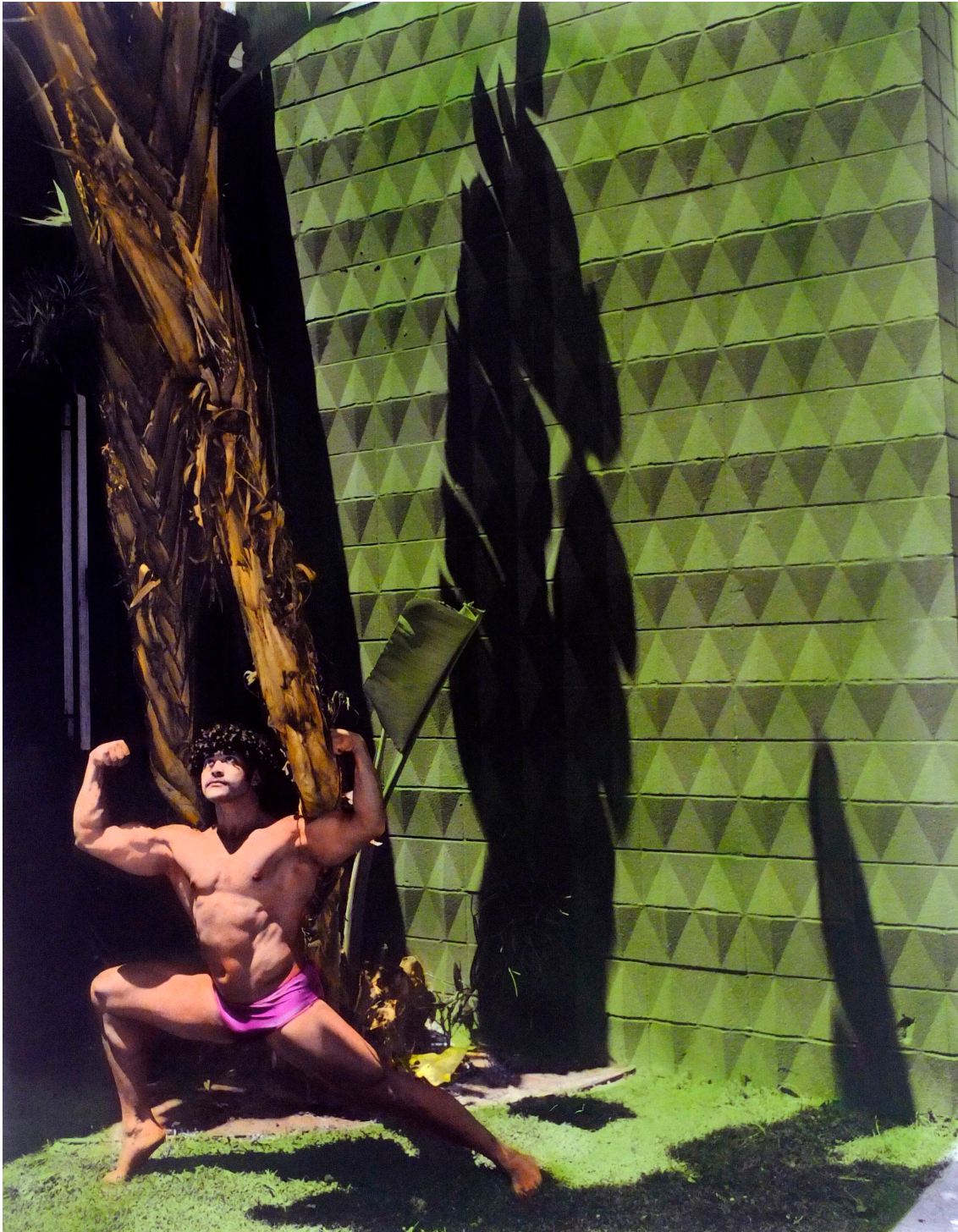
711, 2014. Hand-tinted silver gelatin print, edition of 5 (+2 AP), 36 x 29 in.