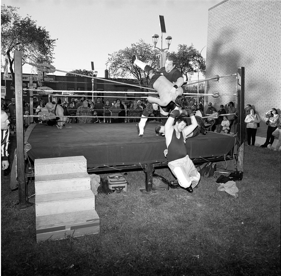
T , 2013. Silver gelatin print, edition of 5 (+2 AP), 29.75 x 29.75 in.