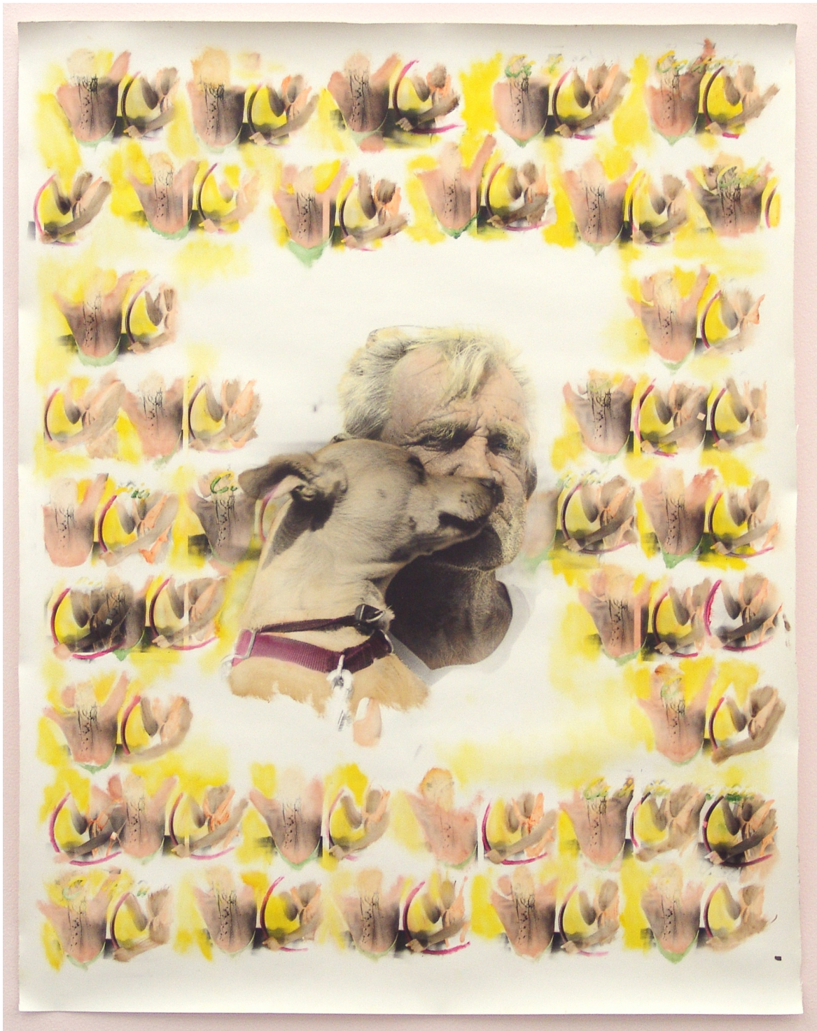
Venice , 2014. Hand-tinted silver gelatin print, edition of 5 (+2 AP), 39 x 31.5 in.