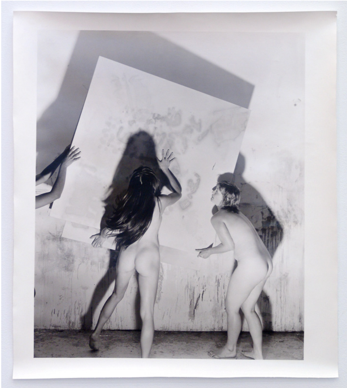
Nudes Moving an Abstract Painting 1 , 2013. Silver gelatin print, part of triptych, edition of 5 (+2 AP), 25 x 20 in.