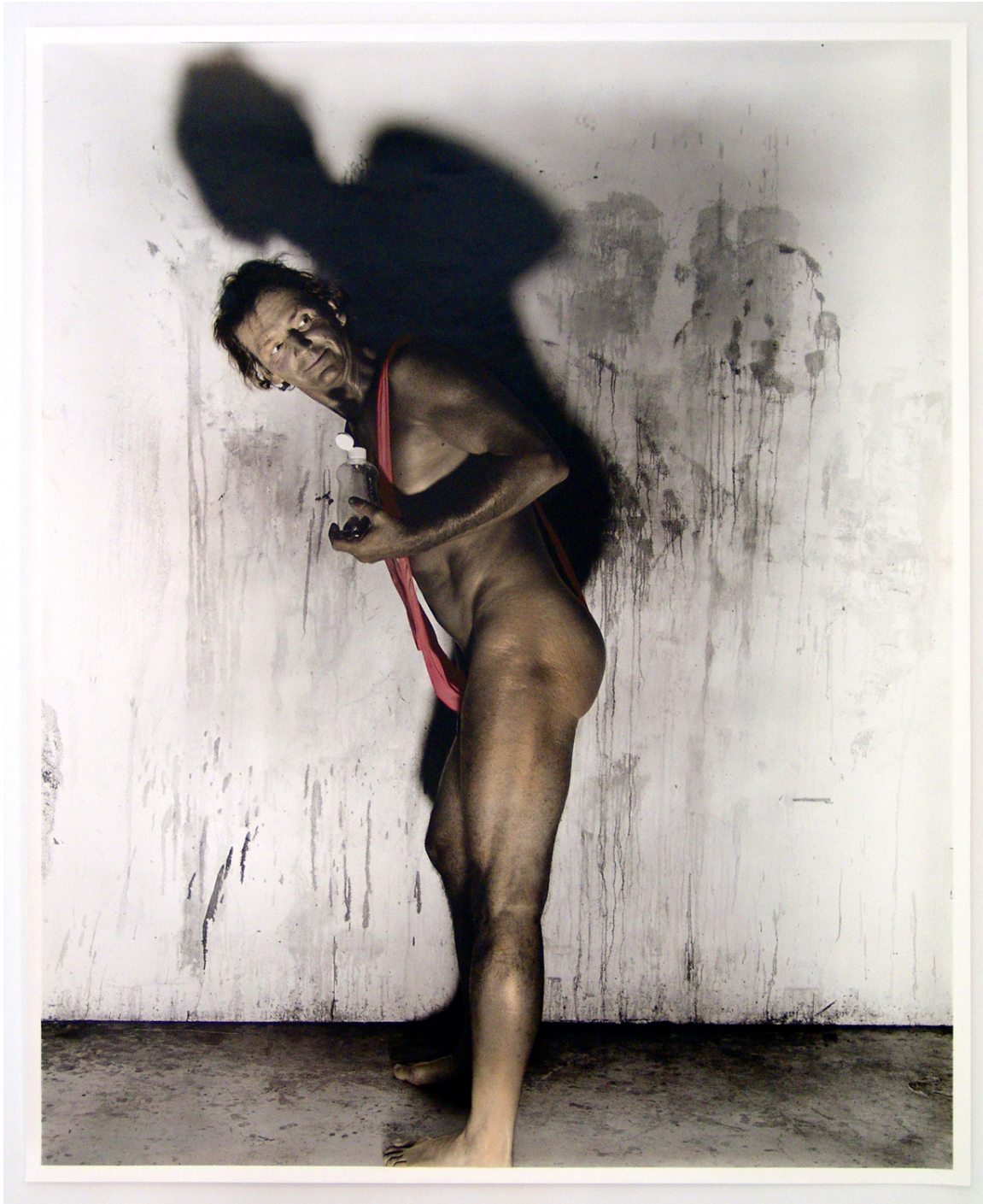
B , 2013. Hand-tinted silver gelatin print, edition of 5 (+2 AP), 37.5 x 29.25 in.