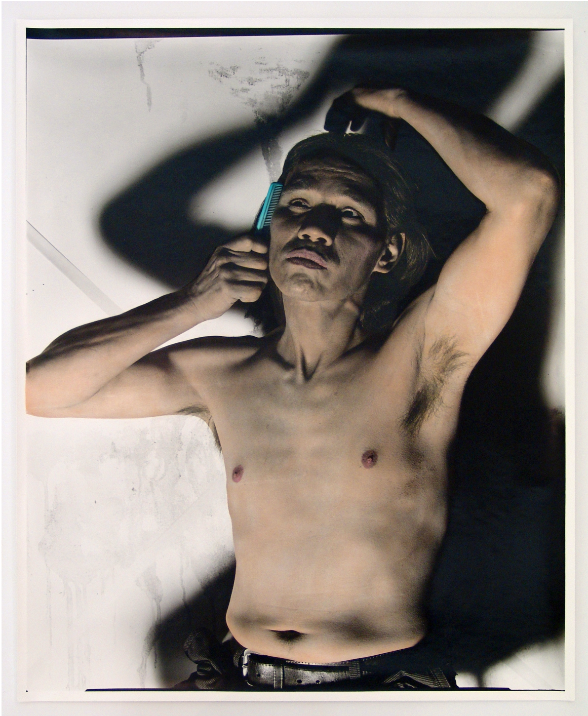
D , 2013. Hand-tinted silver gelatin print, edition of 5 (+2 AP), 38 x 29.5 in.