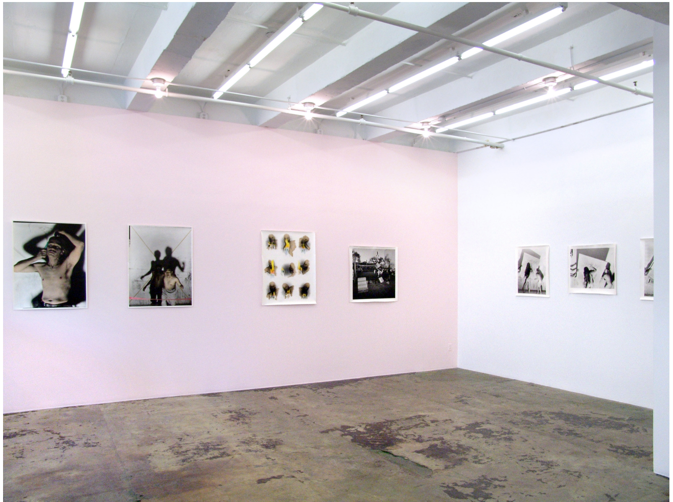
Installation view: east and south wall.