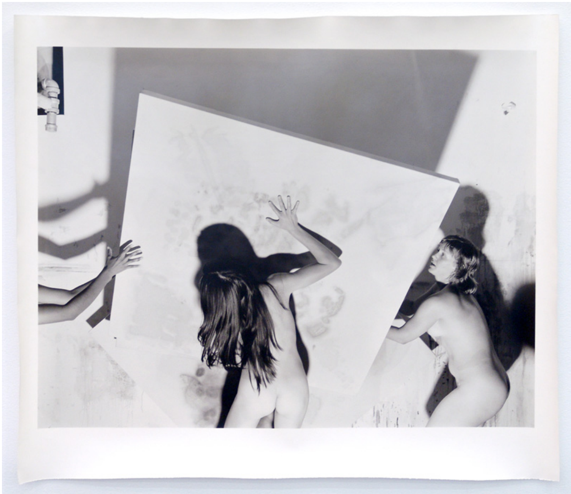
Nudes Moving an Abstract Painting 2 , 2013. Silver gelatin print, part of triptych, edition of 5 (+2 AP), 20 x 25 in.