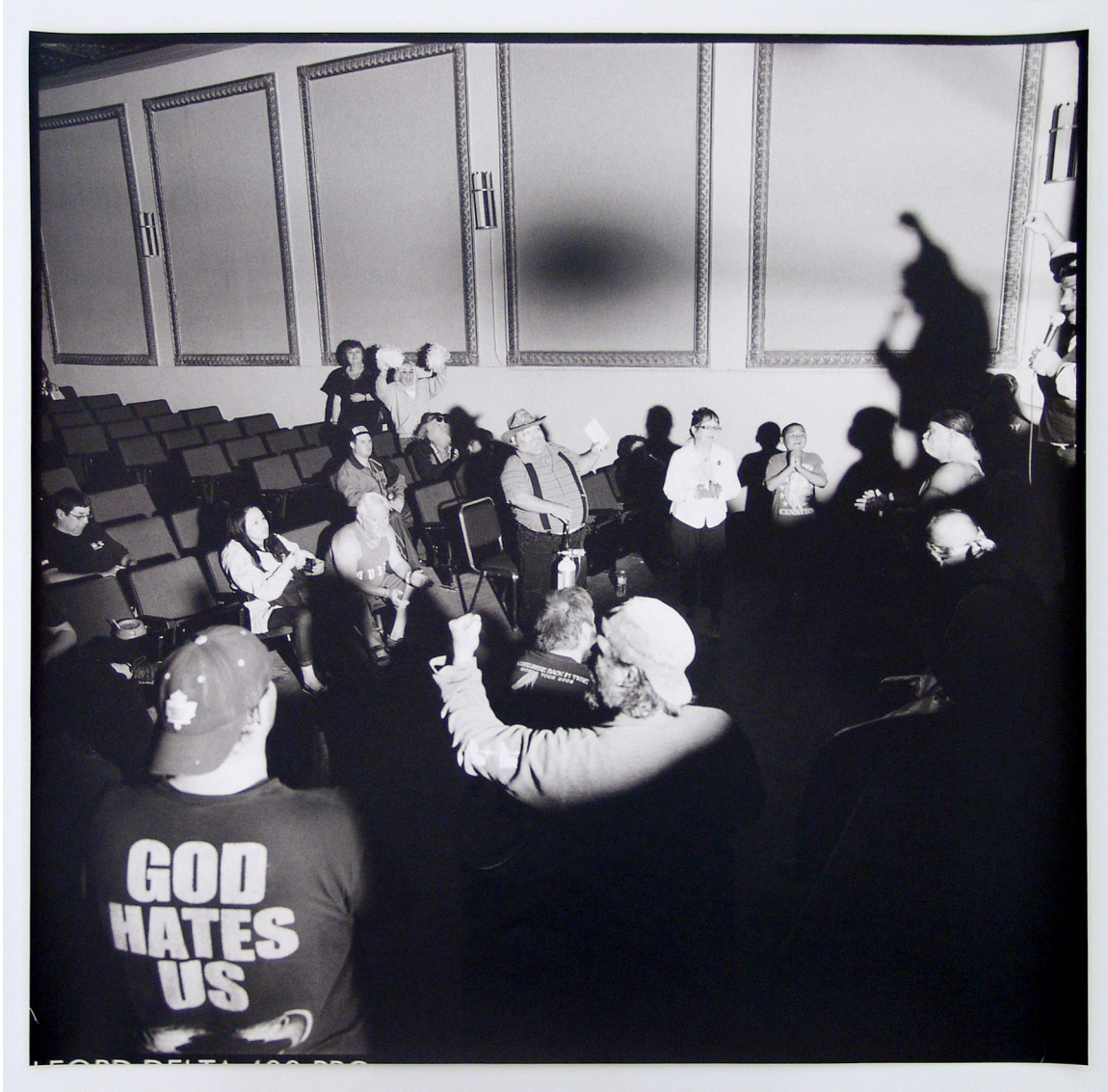
Ellice , 2013. Silver gelatin print, edition of 5 (+2 AP), 29.25 x 29.25 in. (detail)