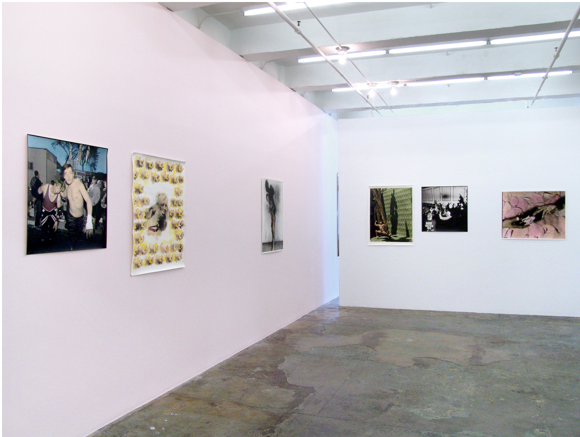
Installation view: west and north wall.