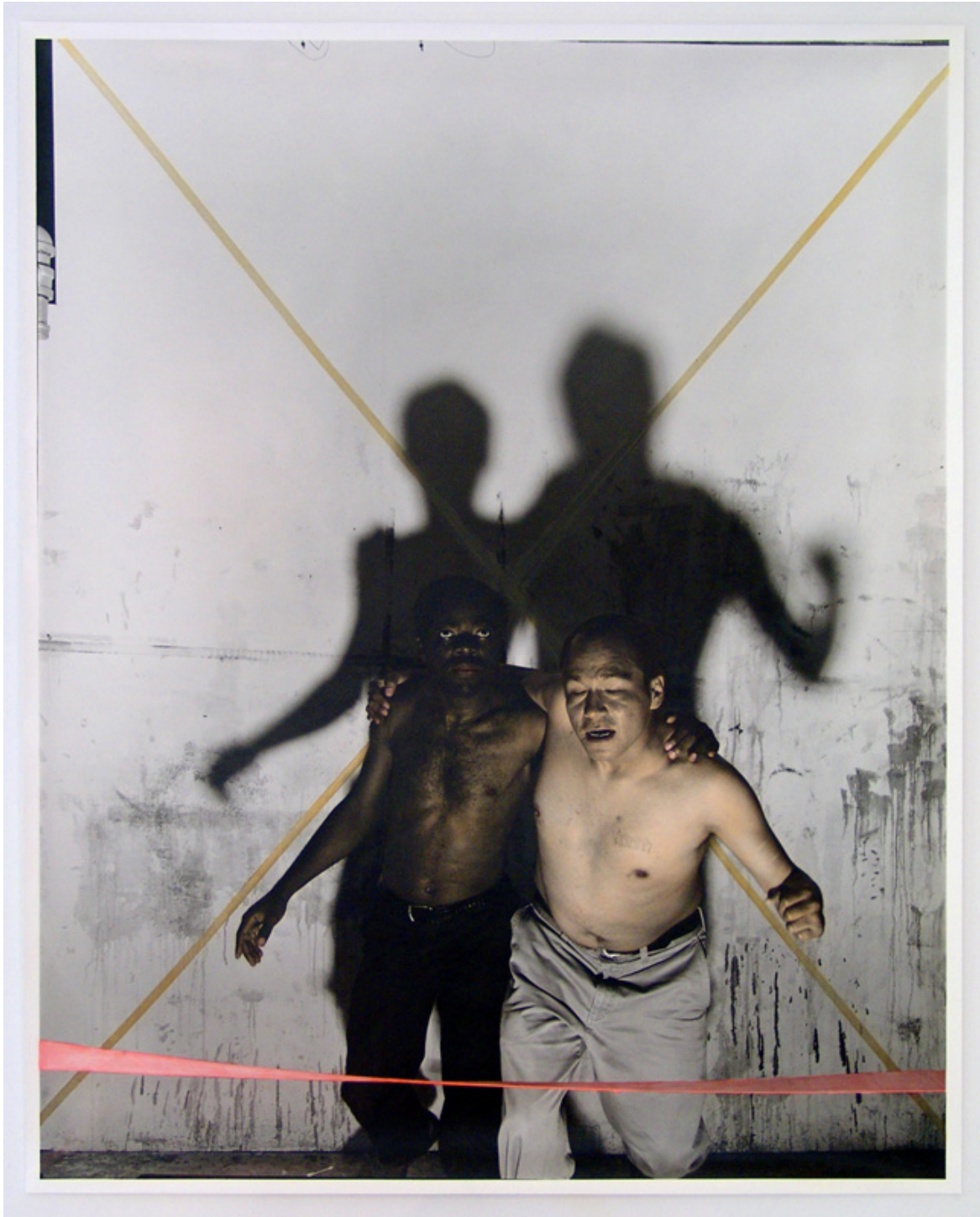
K , 2013. Hand-tinted silver gelatin print, edition of 5 (+2 AP), 38.25 x 30 in.