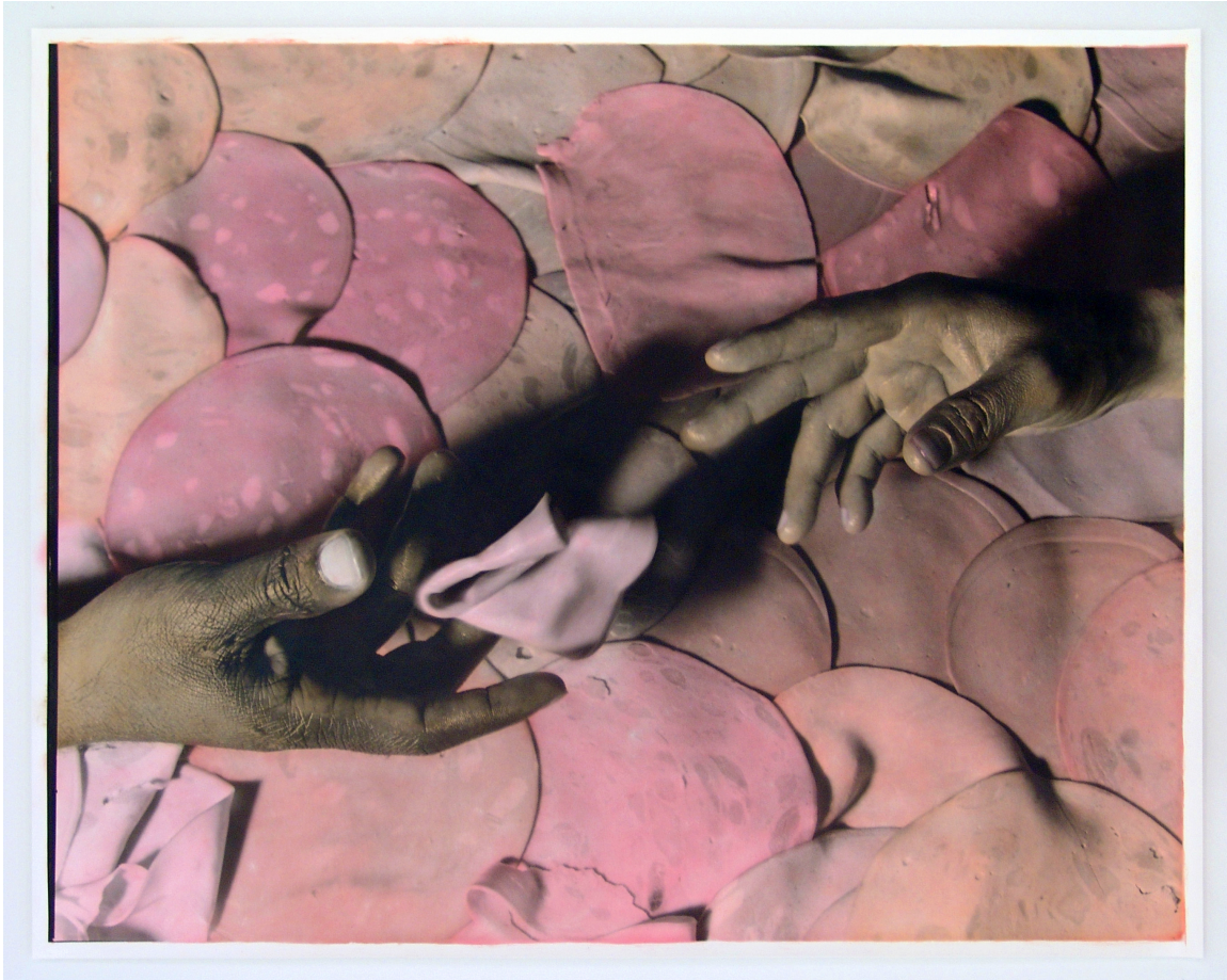
Meat Meet , 2013. Hand-tinted silver gelatin print, edition of 5 (+2 AP), 29.5 x 37.75 in.