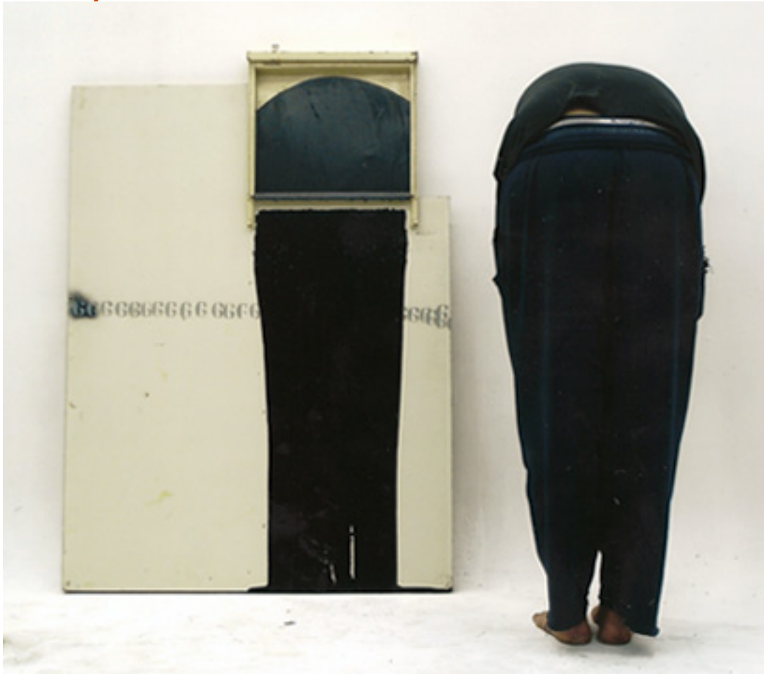
Vijai Patchineelam, Arthur (detail), 2005, Digital Photograph.

Back, forth and round about at Thomas Erben gallery in New York is an exhibit revolving around three visual artists, all of south Asian descent, whose works maneuver in a poetic drift through complexly layered strategies of photography, painting and moving images.