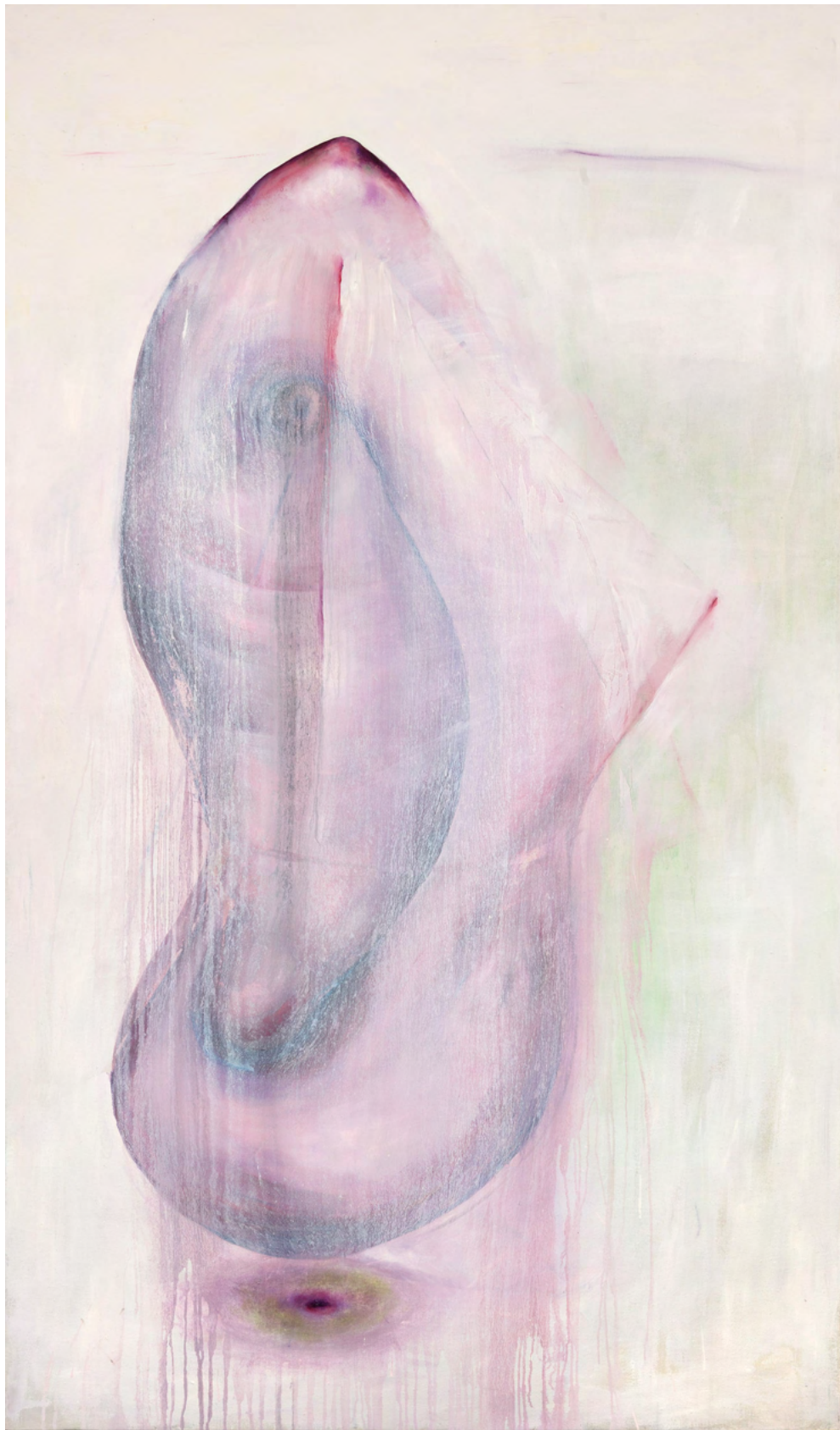
Untitled (recto) , 2020. Oil on canvas, 86.5 x 51 in.