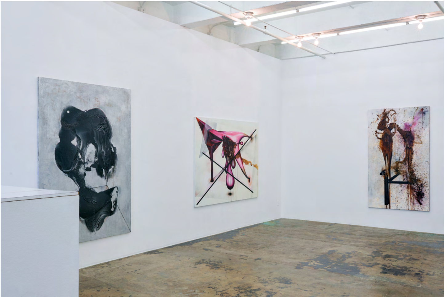
Installation view, east and south walls

Like Kafka's parable, the work of Piotr Janas is marked by an existential dread that manifests in violent fantasies and an acute sensitivity to the absurdity of modern life, especially in the rationalized morality of the state and its institutions. If the effect of Kafka was to reveal the emptiness behind the law's abstractness, Janas' paintings show us how that emptiness deforms the subject, reducing it to little more than quantities of flesh and blood. As the law becomes more and more monstrous, so, too, does Janas' figures, which, rather than sympathy, inspire an ambivalent attraction-repulsion.