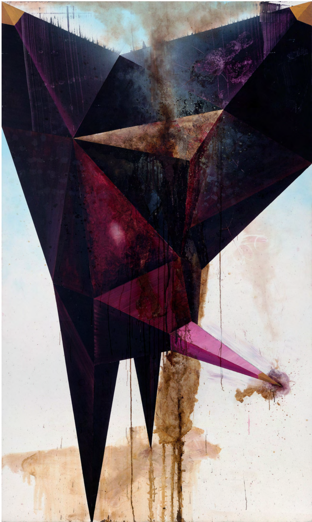
Janas 6 , 2013. Oil and lacquer on canvas, 97.5 x 58.25 in.