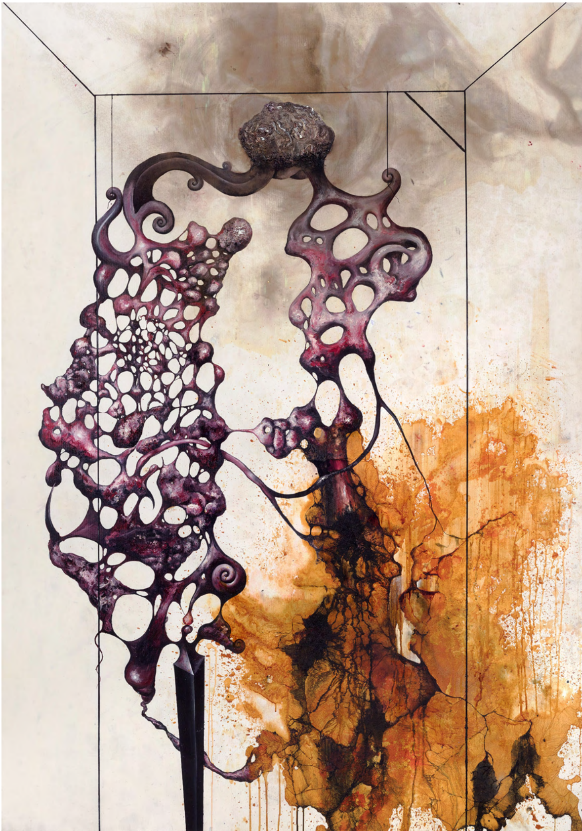
Untitled/Baroque , 2016. Oil and lacquer on canvas, 78.75 x 56 in.