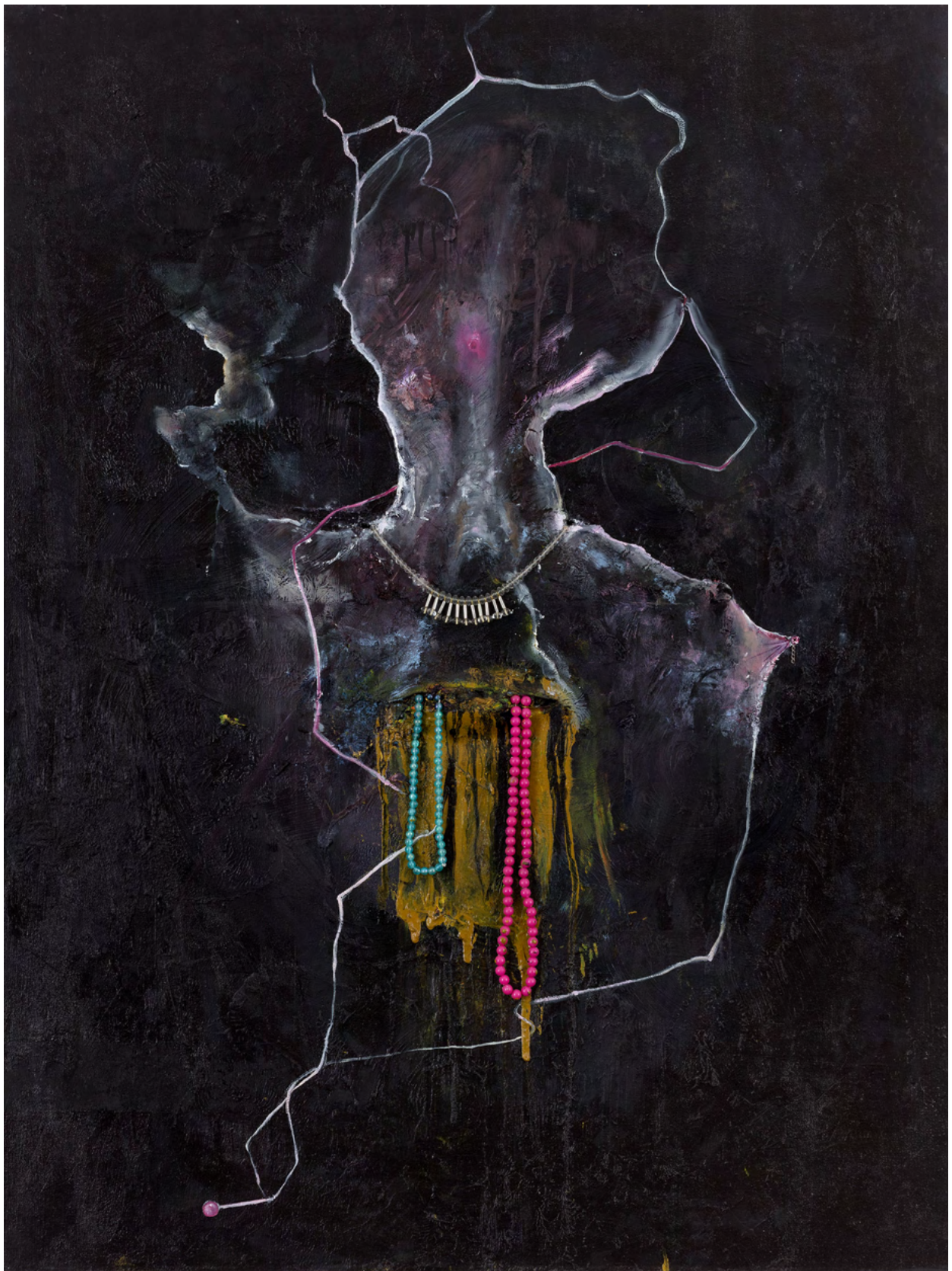
Vomit , 2008. Oil on canvas with beads, 47.25 x 35.5 in.