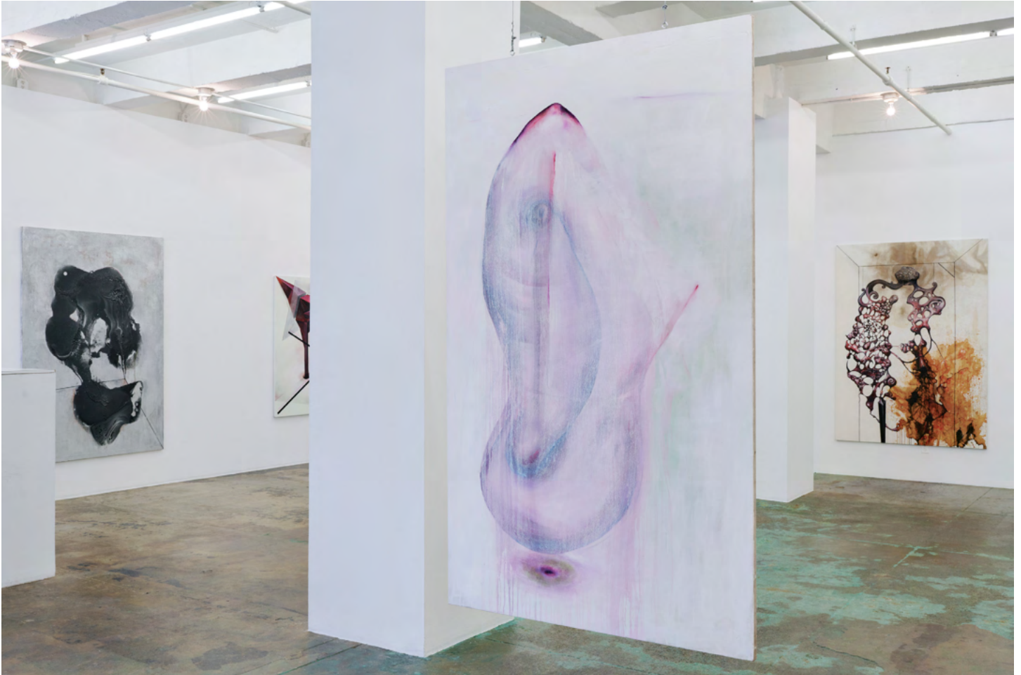
Installation view, east and south walls