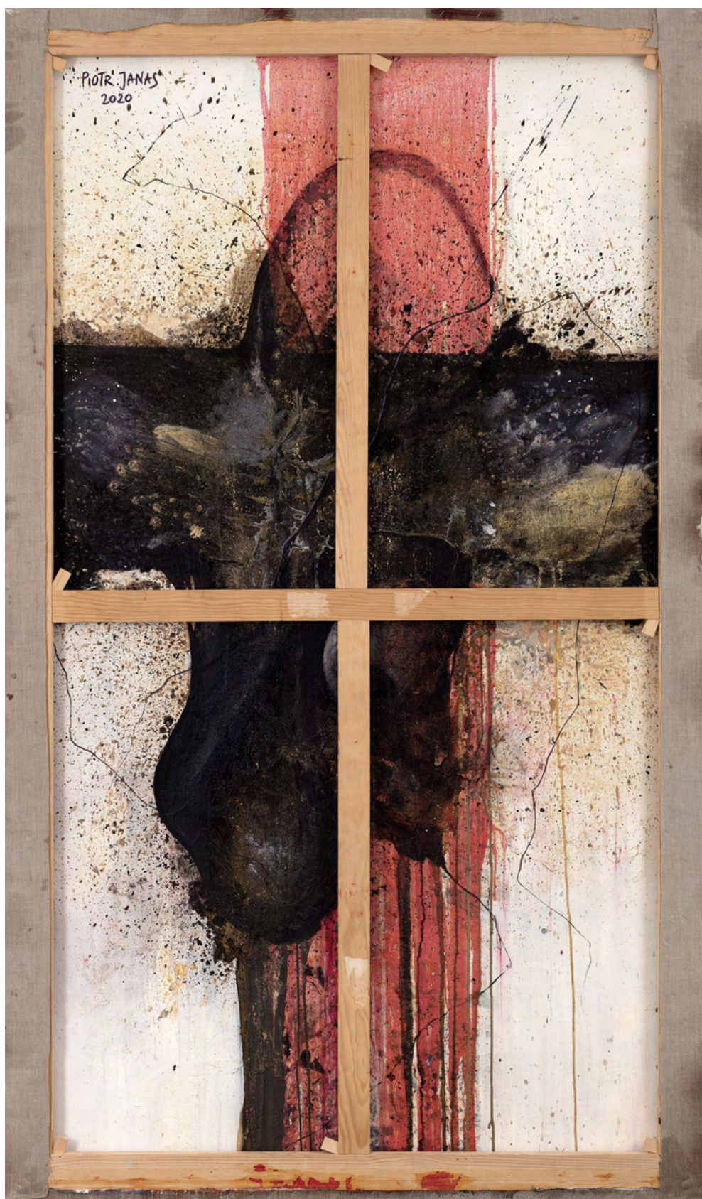
Untitled (verso) , 2020. Oil on canvas, 86.5 x 51 in.