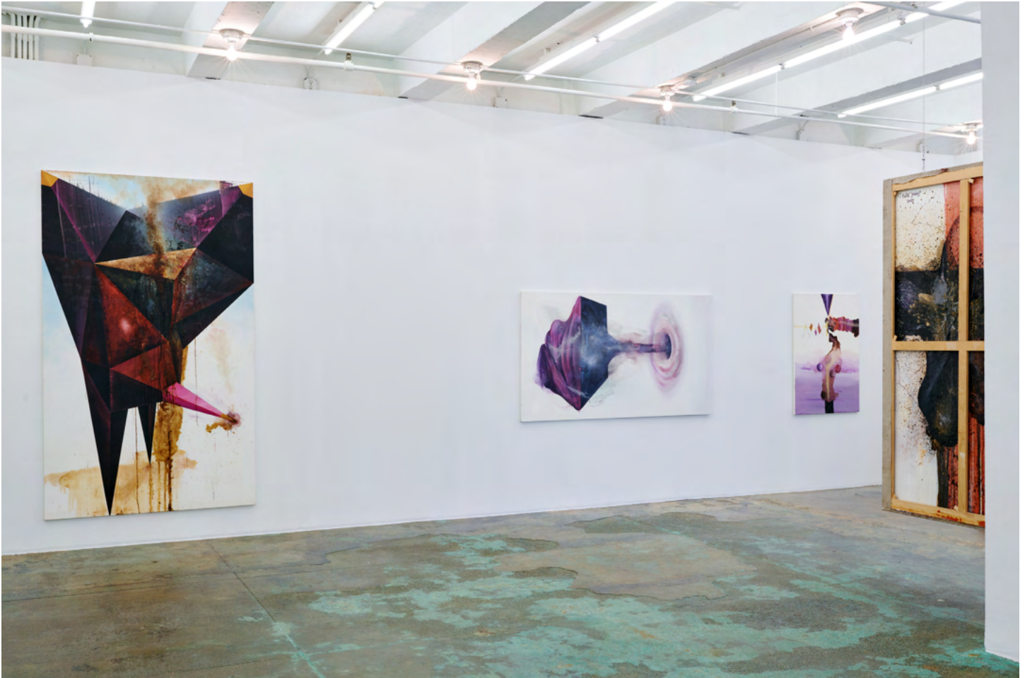
Installation view, west wall.

Thomas Erben Gallery is pleased to present Piotr Janas' (b. 1970, Warsaw) first exhibition with the gallery, featuring paintings made between 2008 and 2020. Since emerging in the young Polish scene in the early '00s, Janas has become known for intense, visceral paintings that meditate on the collision between biomorphism and the formal language of modernist abstraction.