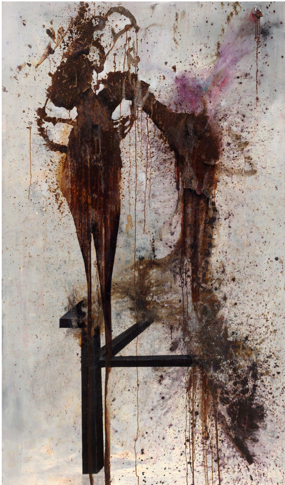
Untitled , 2013. Oil on canvas, 75.5 x 43.25 in.