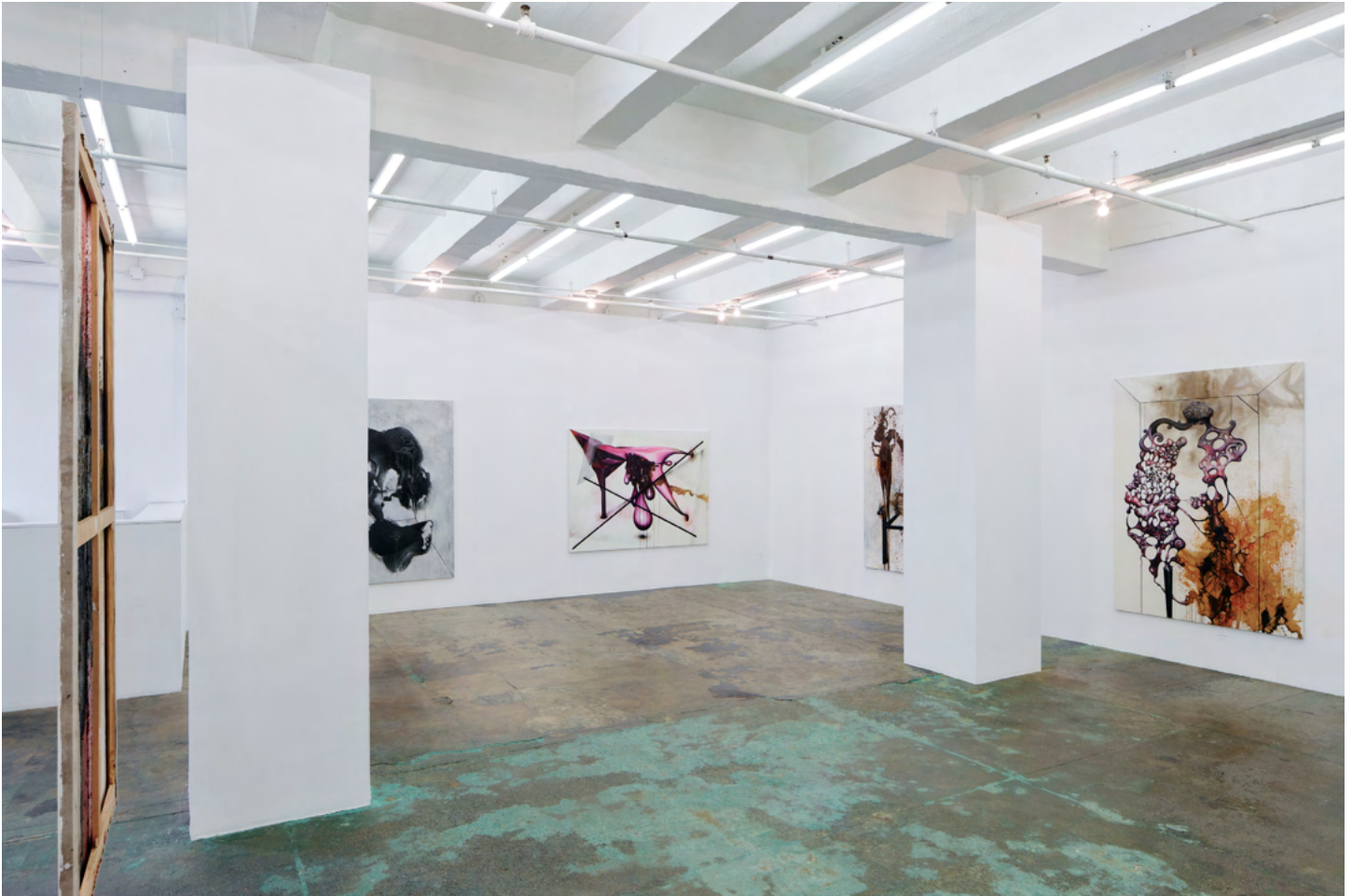
Installation view, east and south walls