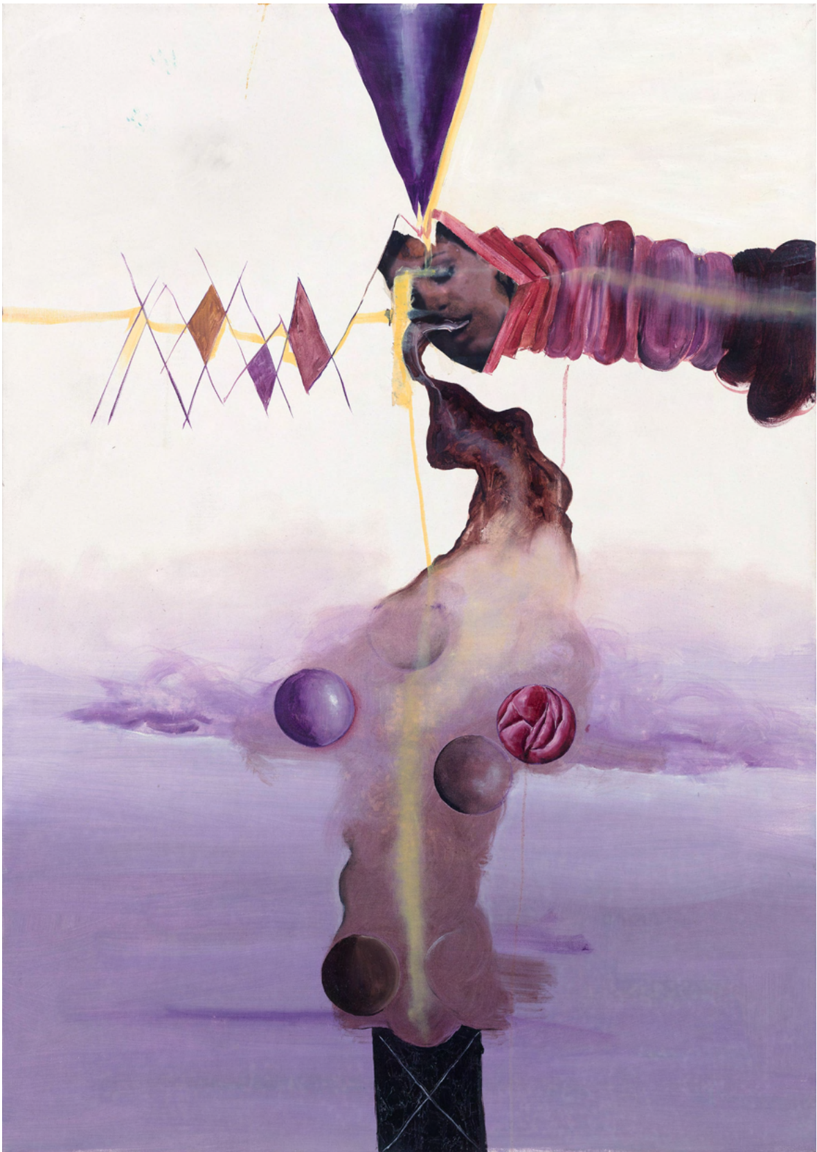
Cross, 2009. Oil on canvas, 47.25 x 33.5 in.