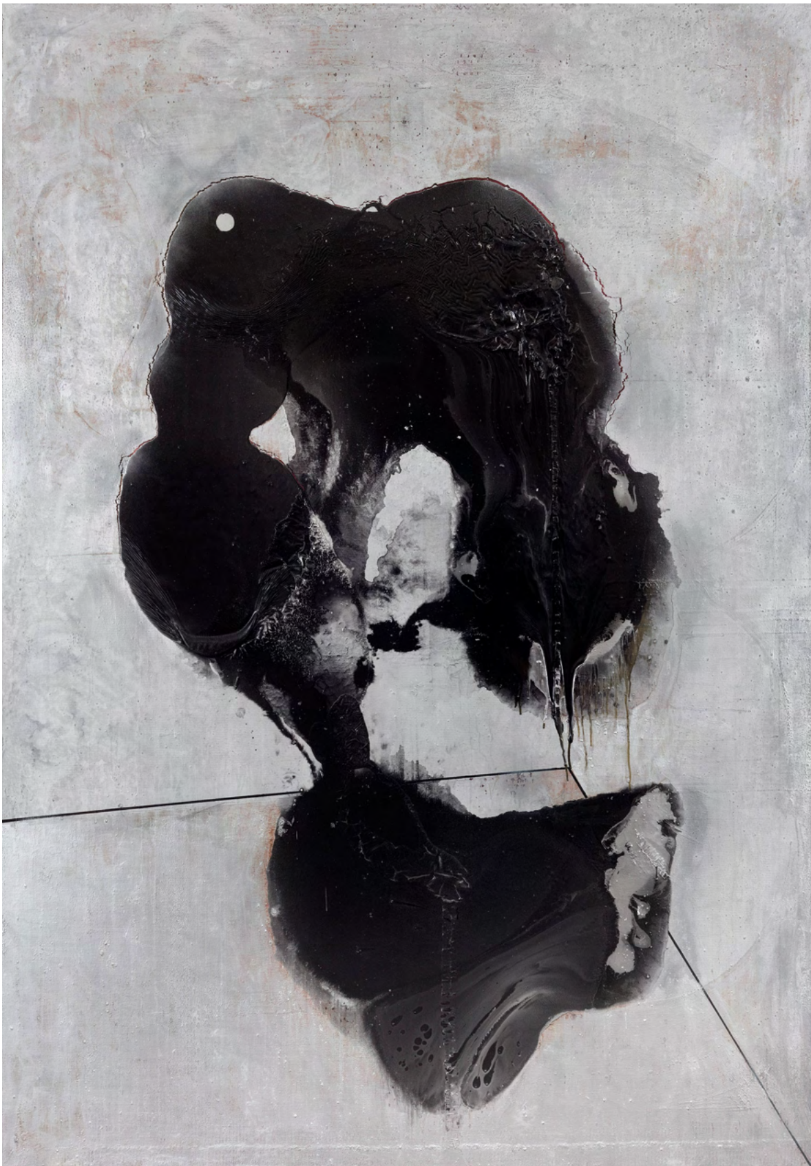
Cleaver , 2015. Oil and lacquer on canvas, 78.75 x 55 in.