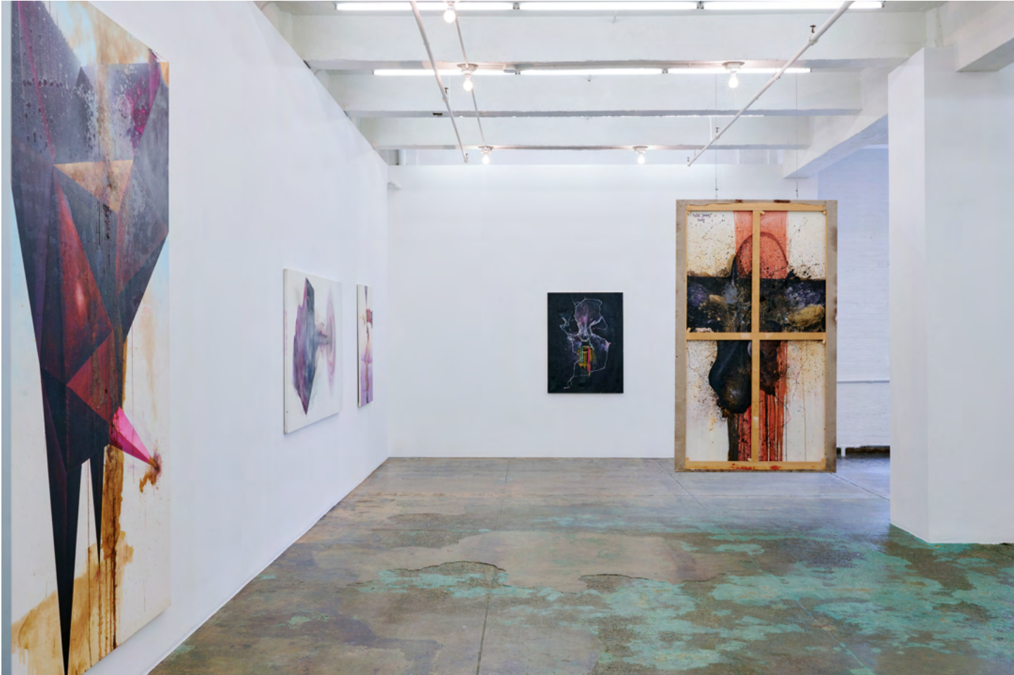
Installation view, west and north walls