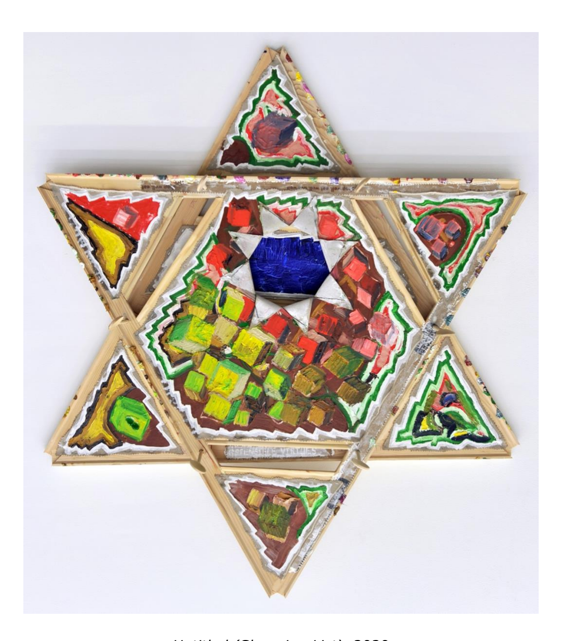
Untitled (Shopping List), 2020 52" x 58" x 12" (132.08 cm x 147.32 cm x 30.48 cm) Oil on linen with mixed media $ 18,000