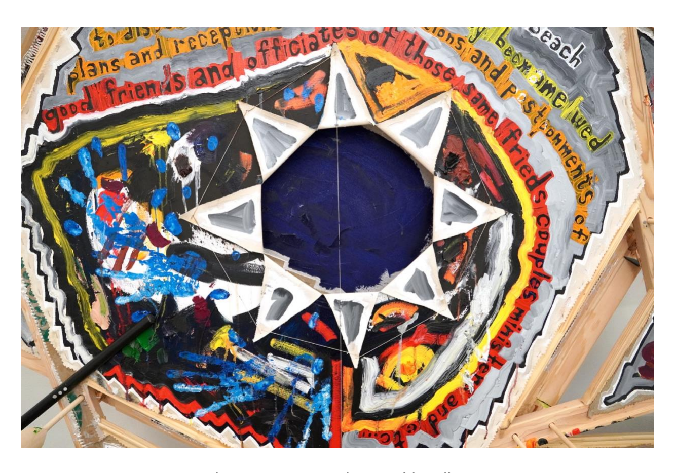
Mixed Marriage Bering/Strain (detail), 2020 87" x 150" x 18" (220.98 cm x 381 cm x 45.72 cm) Oil on linen with mixed media