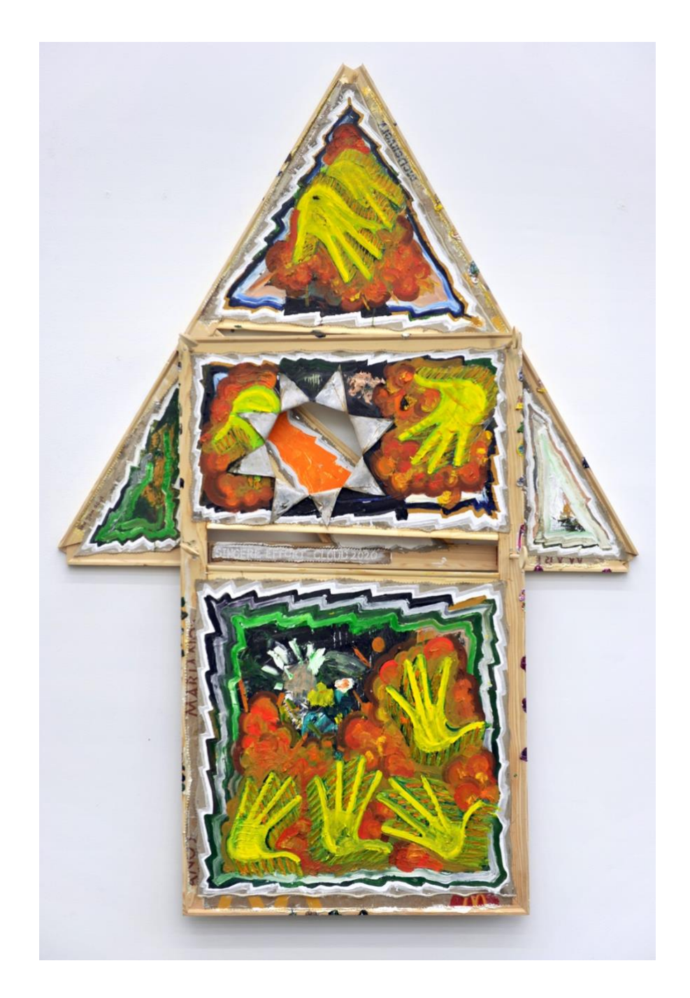
Hero Andrew Garcia, 2020 50" x 53" x 12" (127 cm x 134.62 cm x 30.48 cm) Oil on linen with mixed media $21,000