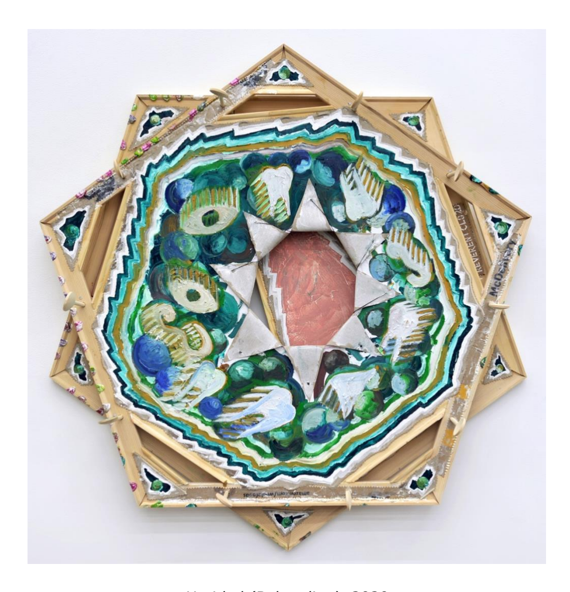
Untitled (Beheading), 2020 50" \times 52" \times 12" (127 cm \times 132.08 cm \times 30.48 cm) Oil on linen with mixed media $ 18,000