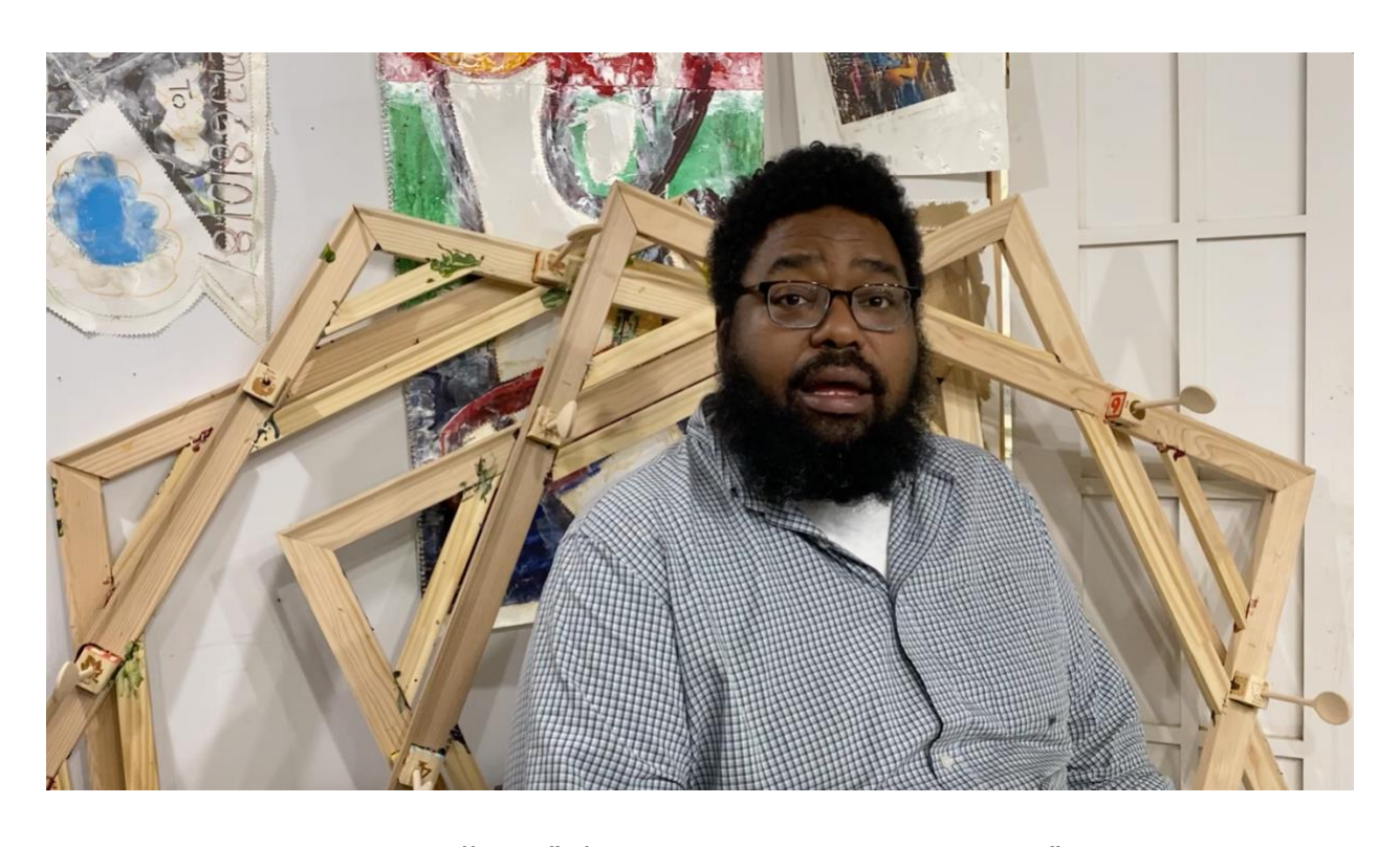
Artist talk on "Shopping List Greener Pastures" Video documentation 02:43 min