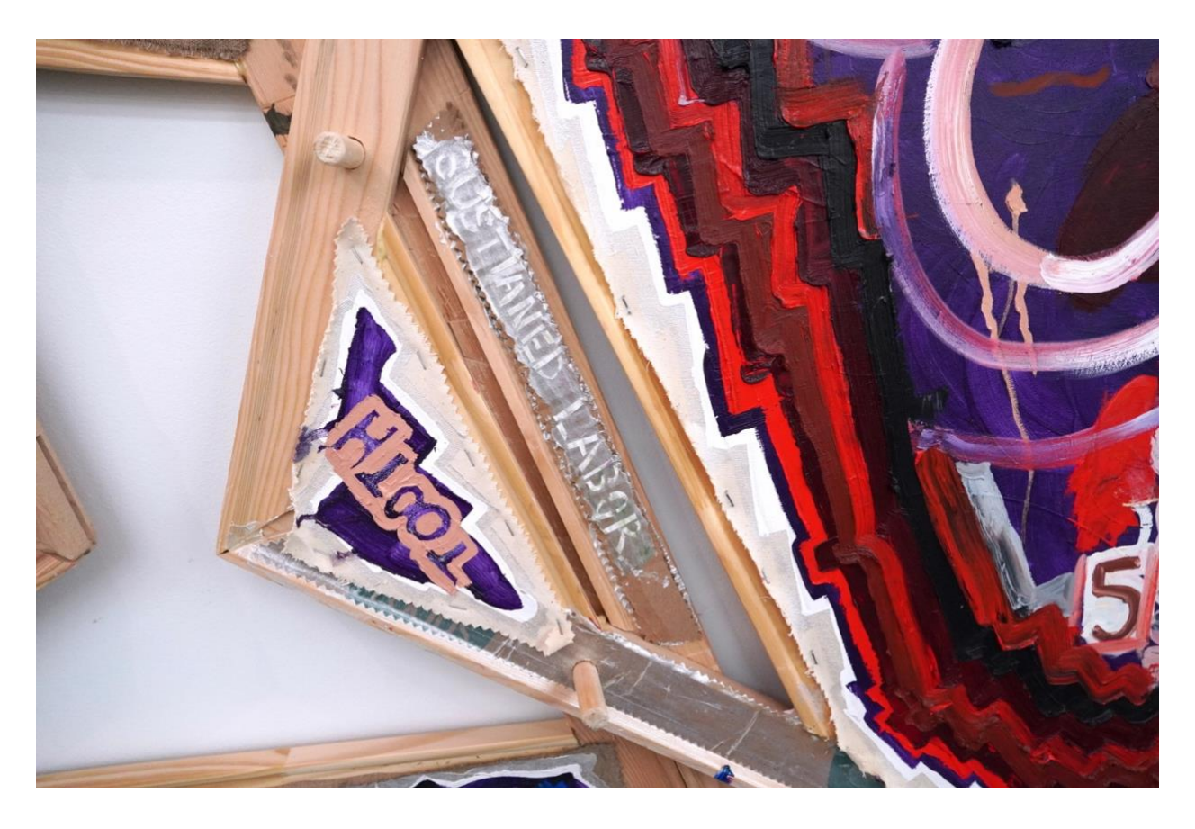
Beheading James Slemp (Detail), 2020 68" x 132" x 4" (172.72 cm x 335.28 cm x 10.16 cm) Oil on linen with mixed media