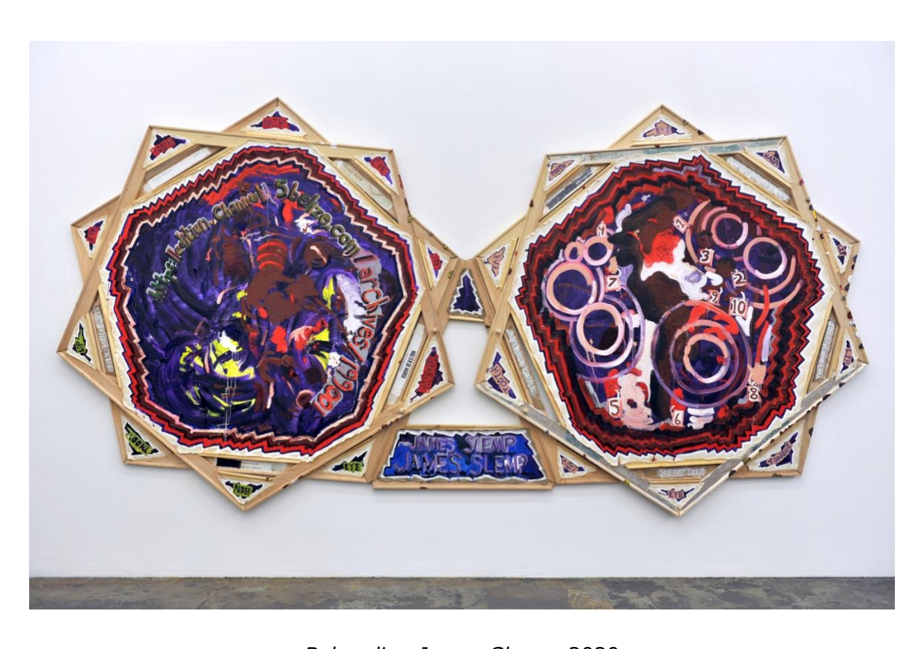
Beheading James Slemp, 2020 68" x 132" x 4" (172.72 cm x 335.28 cm x 10.16 cm) Oil on linen with mixed media $34,000