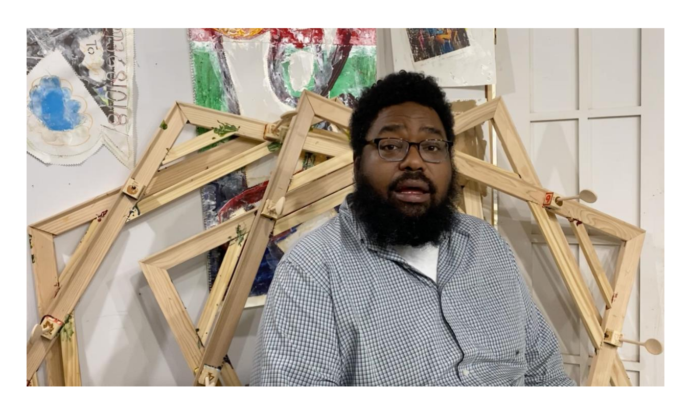
Artist Talk on Portraiture, 2020 Video Documentation 05:36 min.