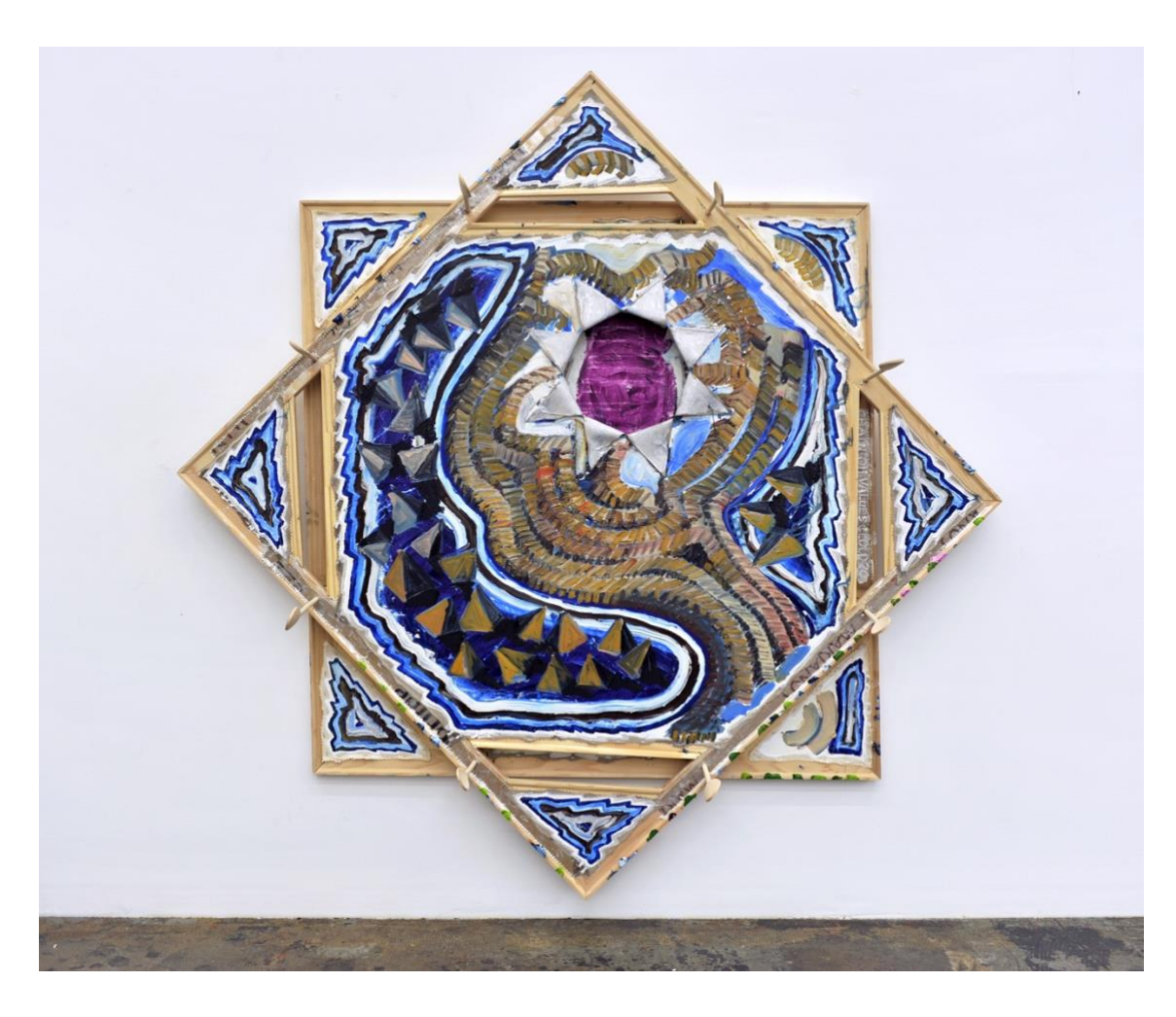
Untitled (Marriage), 2020 70" x 70" x 12" (177.8 cm x 177.8 cm x 30.48 cm) Oil on linen with mixed media $21,000