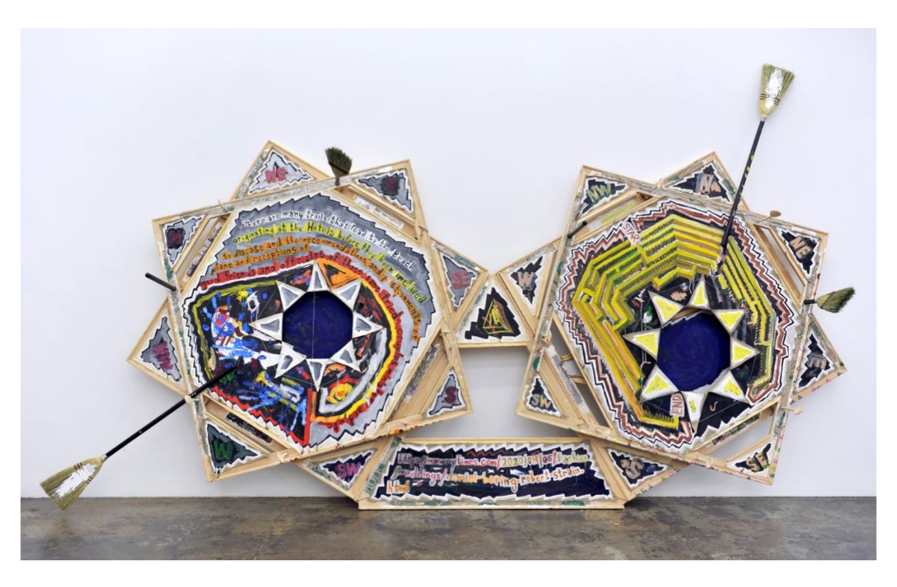
Mixed Marriage Bering/Strain, 2020 87" x 150" x 18" (220.98 cm x 381 cm x 45.72 cm) Oil on linen with mixed media $34,000