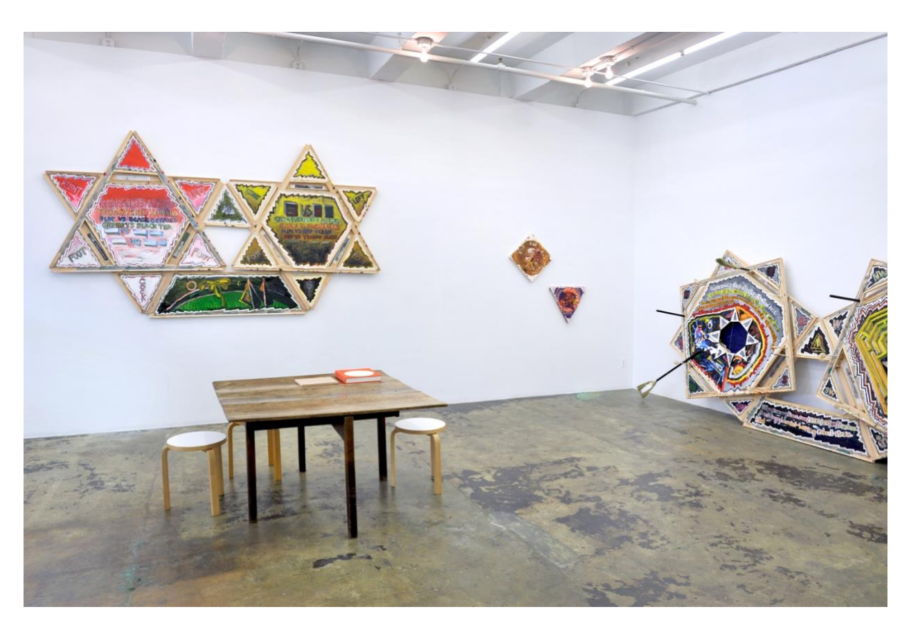
Installation view from Mike Cloud, New Paintings (2020) at the gallery.