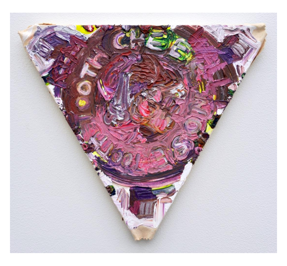
Kim Wall, 2019 14" x 16" x 1.5" (35.56 cm x 40.64 cm x 3.81 cm) Acrylic on canvas \$ \ 6,000