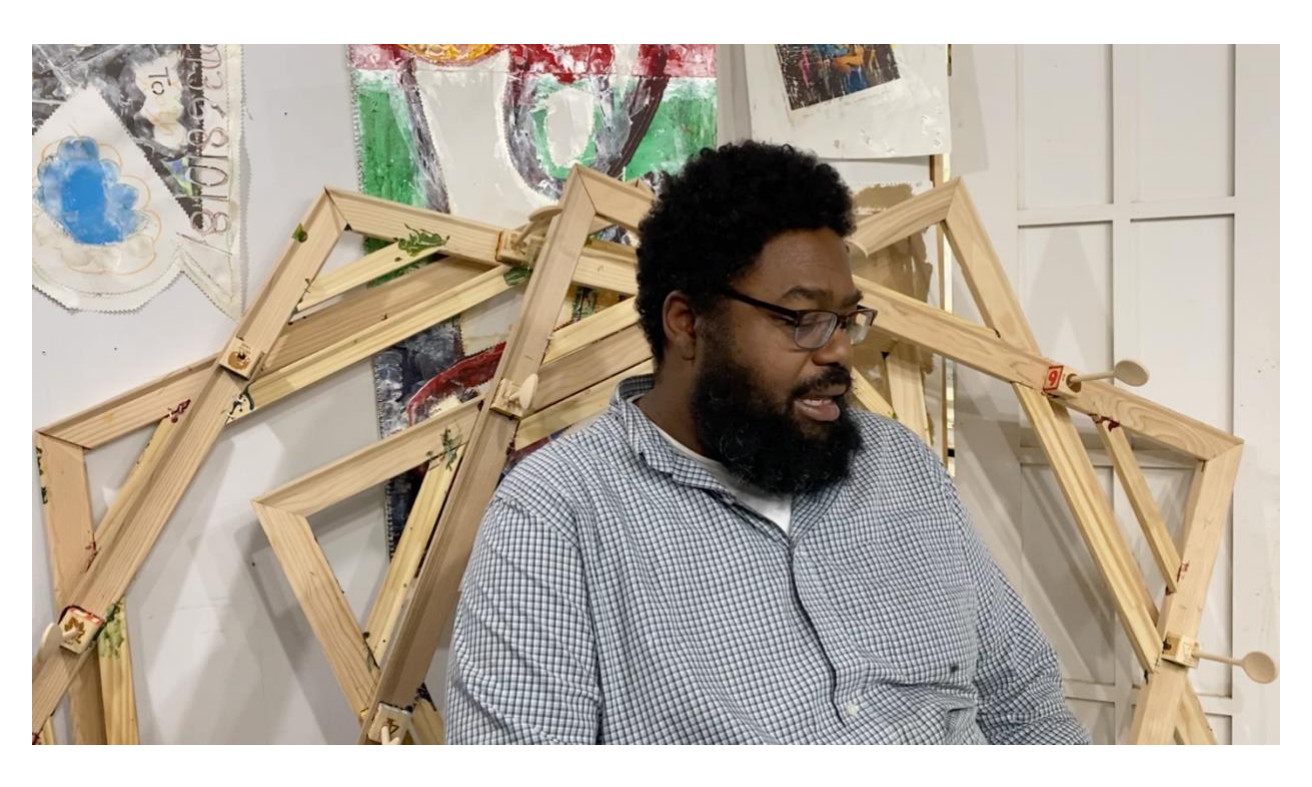
Artist Talk on "Mixed Marriage Bering/Strain", 2020 Video Documentation 03:51 min