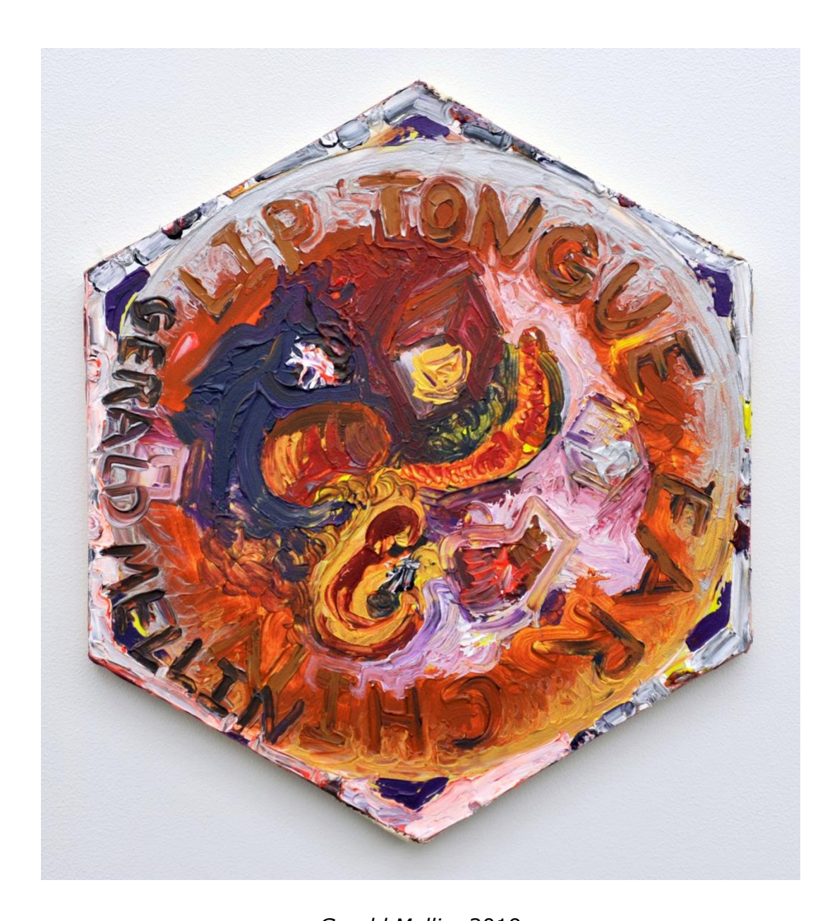
Gerald Mellin, 2019 21" x 24.5" x 1.5" (53.34 cm x 62.23 cm x 3.81 cm) Acrylic on canvas $7,500