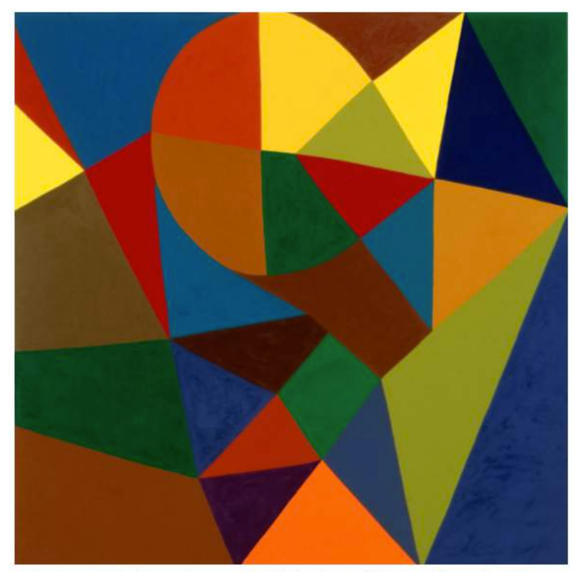
Harriet Korman, "Untitled" (2001), oil on canvas, 60 x 60 inches

Every mark and color Korman applies reinforces the fact that a painting is a twodimensional surface. By stripping down the paintings to the irreducible elements of line and color, but never settling for a fashionable format, such as a grid, to deliver them, she attains a singular position as one of New York's purest abstract painters without a brand.