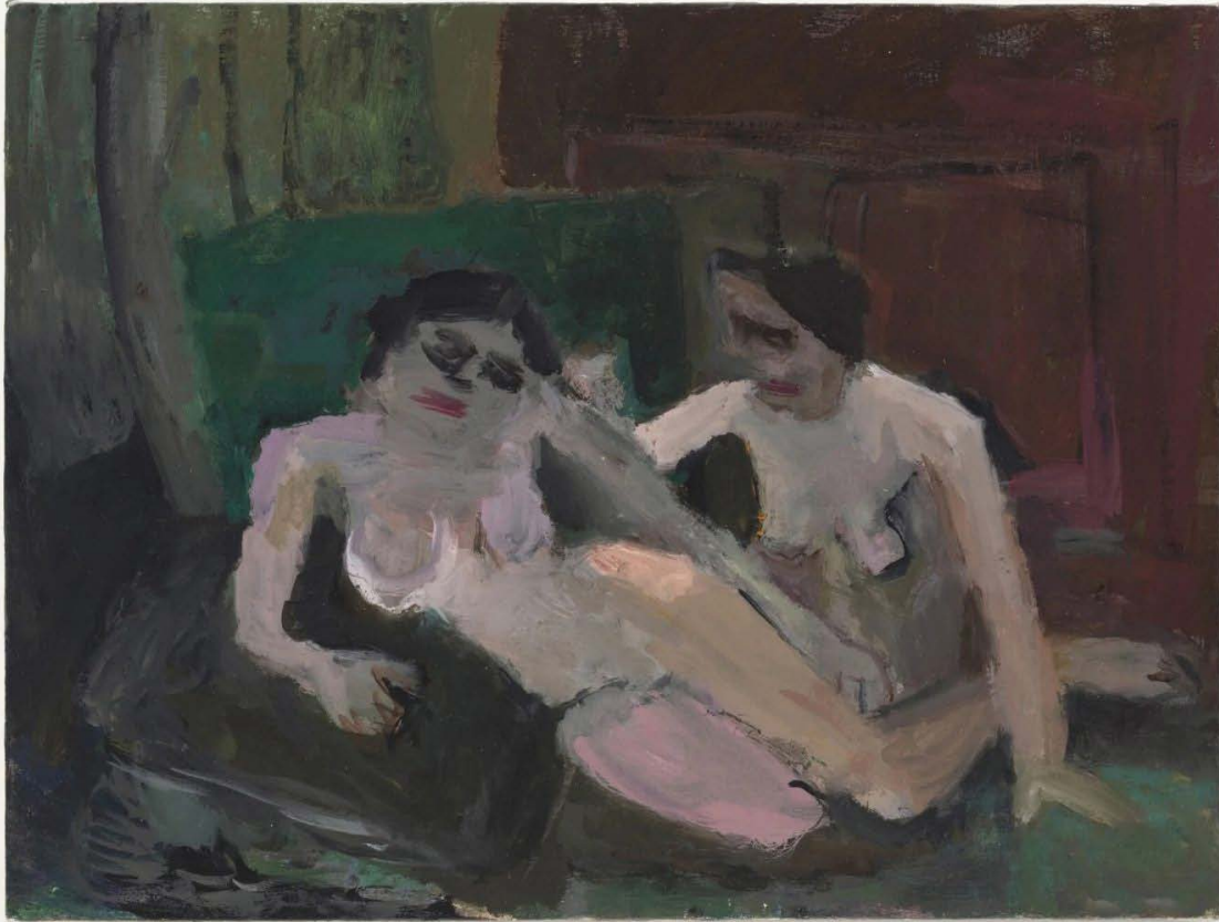
Janice Nowinski, Two Nudes , 2020, oil on Linen, 12 x 16 inches