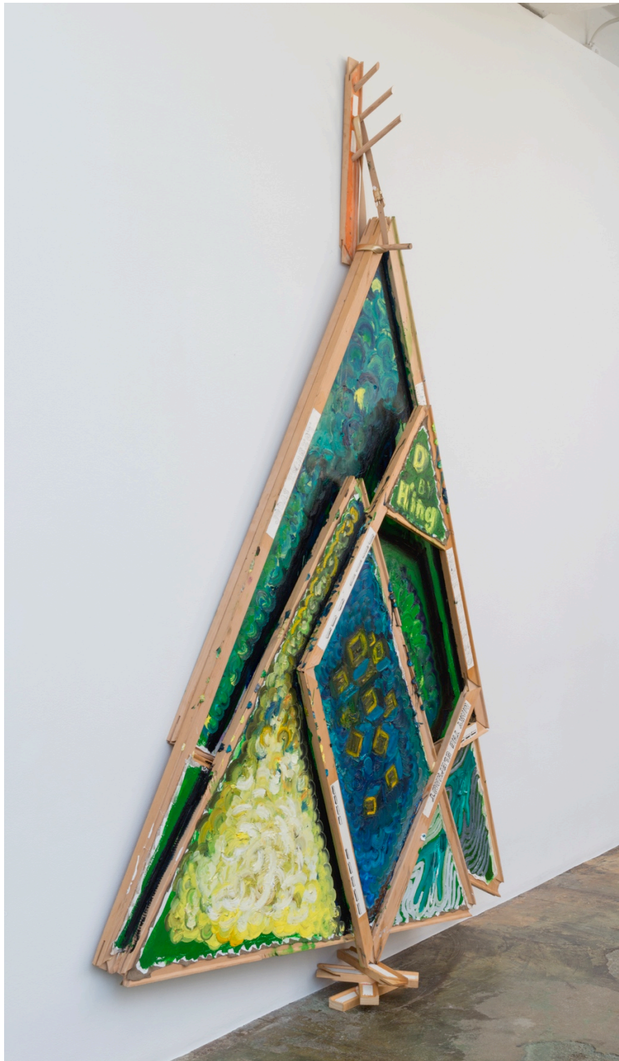
L of L , 2016. Oil on linen and stretcher bars 93 x 80 x 5 in.