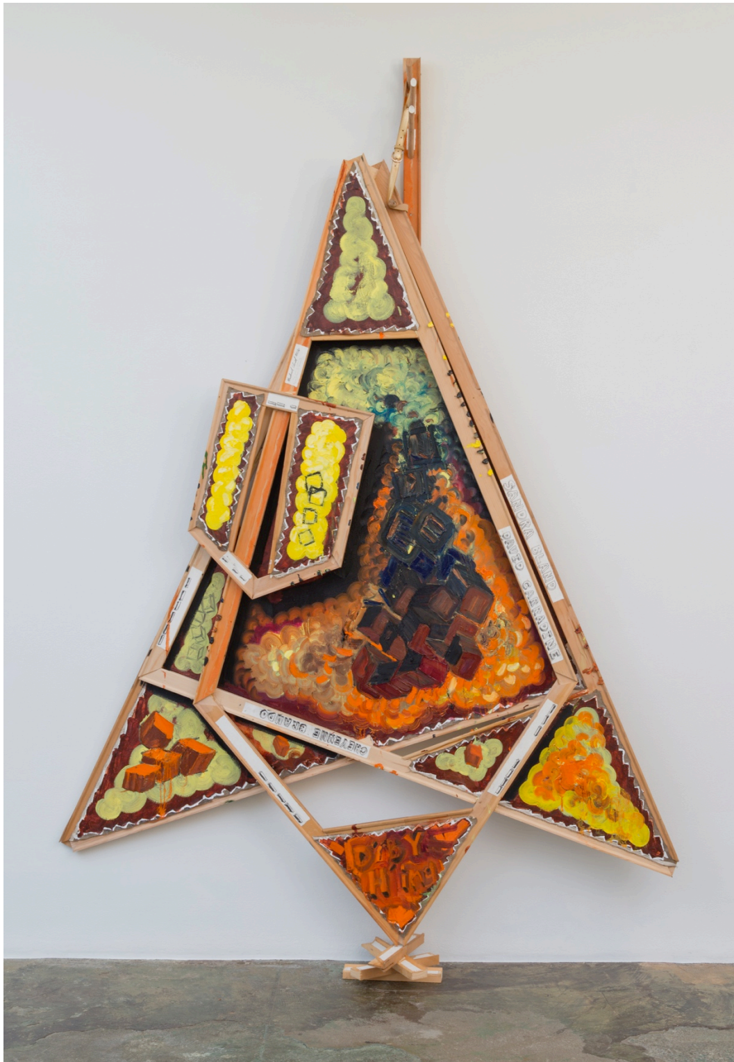
S of B , 2016. Oil on linen and stretcher bars 100 x 80 x 5 in.