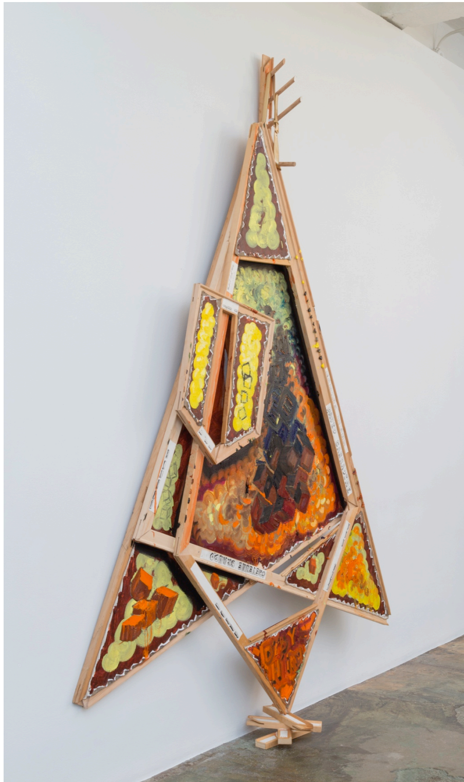
S of B , 2016. Oil on linen and stretcher bars 100 x 80 x 5 in.