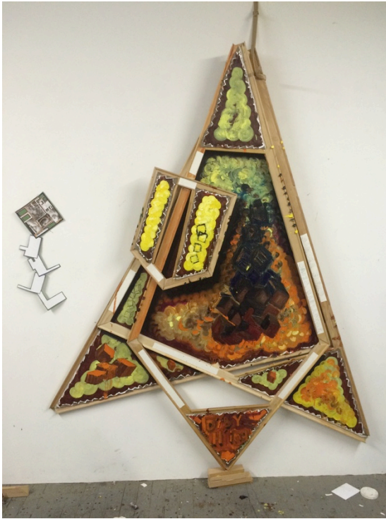
S of B , 2016. Oil on linen and stretcher bars, 100 x 80 x 5 in.