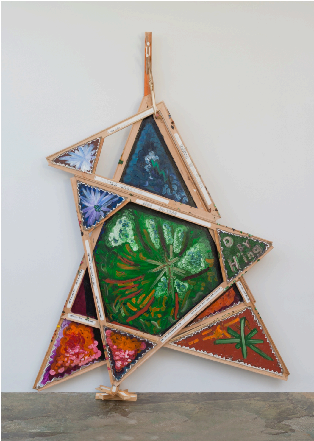
F of J , 2016. Oil on linen and stretcher bars 90 x 80 x 4 in.