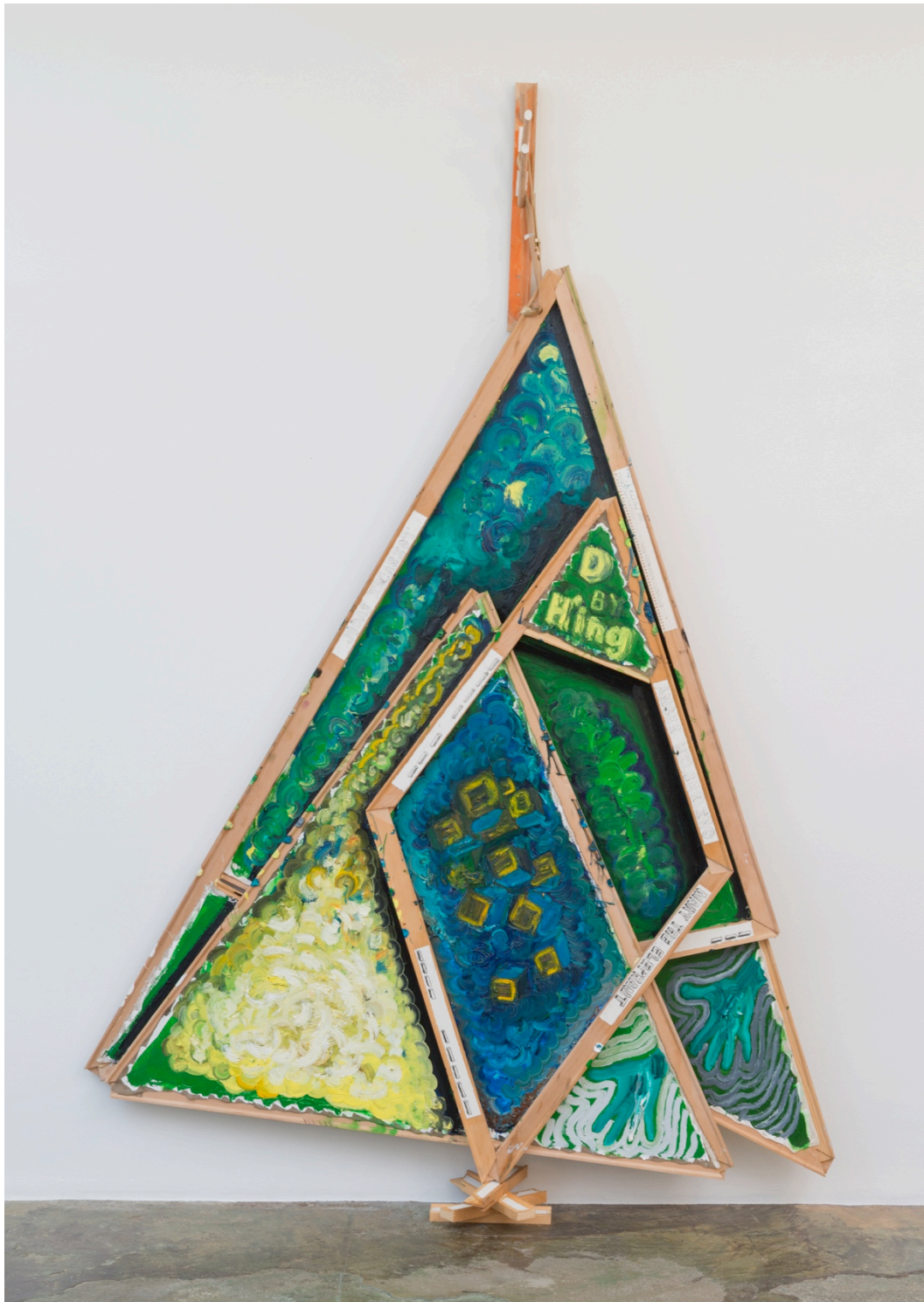
L of L , 2016. Oil on linen and stretcher bars 93 x 80 x 5 in.