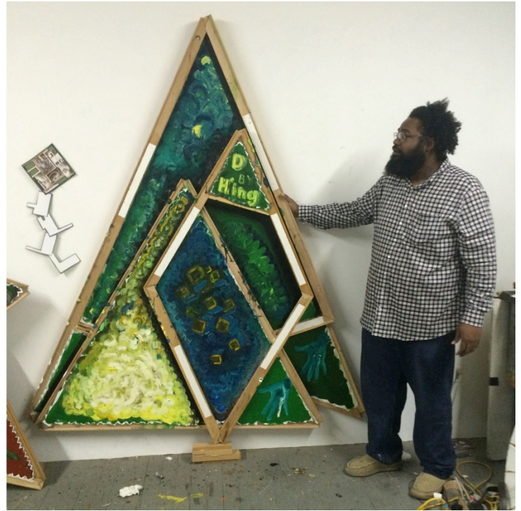
L of L , 2016. Oil on linen and stretcher bars, 93 x 80 x 5 in.