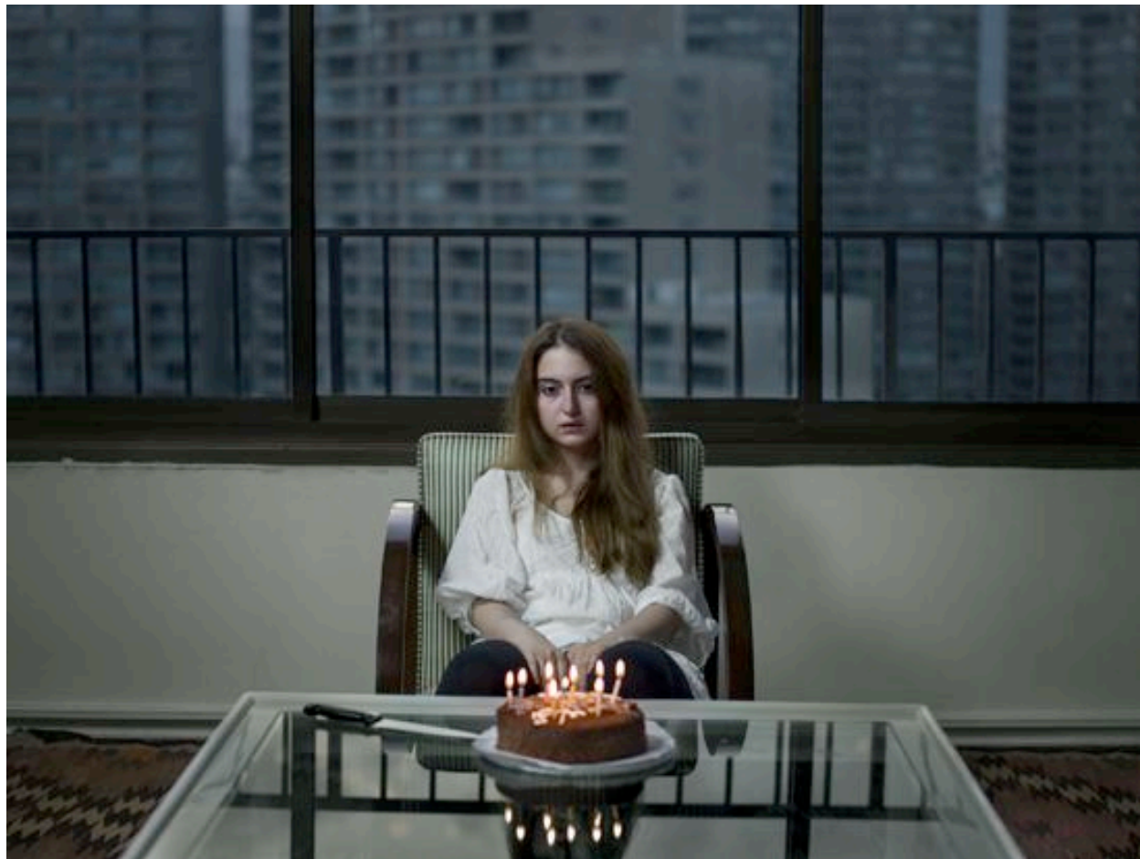
Look (2012) Inkjet print, edition of 7 (+2 AP) 41 x 55 inches

Thomas Erben Gallery 526 West 26 th Street, 4 th floor New York, NY 10001 www.thomaserben.com info@thomaserben.com