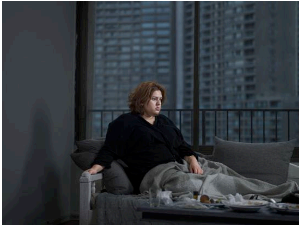
Look (2012) Inkjet print, edition of 7 (+2 AP) 41 x 55 inches

Thomas Erben Gallery 526 West 26 th Street, 4 th floor New York, NY 10001 www.thomaserben.com info@thomaserben.com