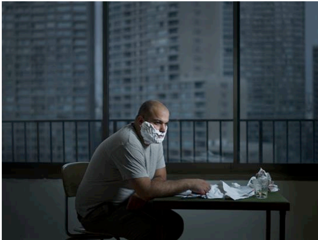
Look (2012) Inkjet print, edition of 7 (+2 AP) 41 x 55 inches

Thomas Erben Gallery 526 West 26 th Street, 4 th floor New York, NY 10001 www.thomaserben.com info@thomaserben.com