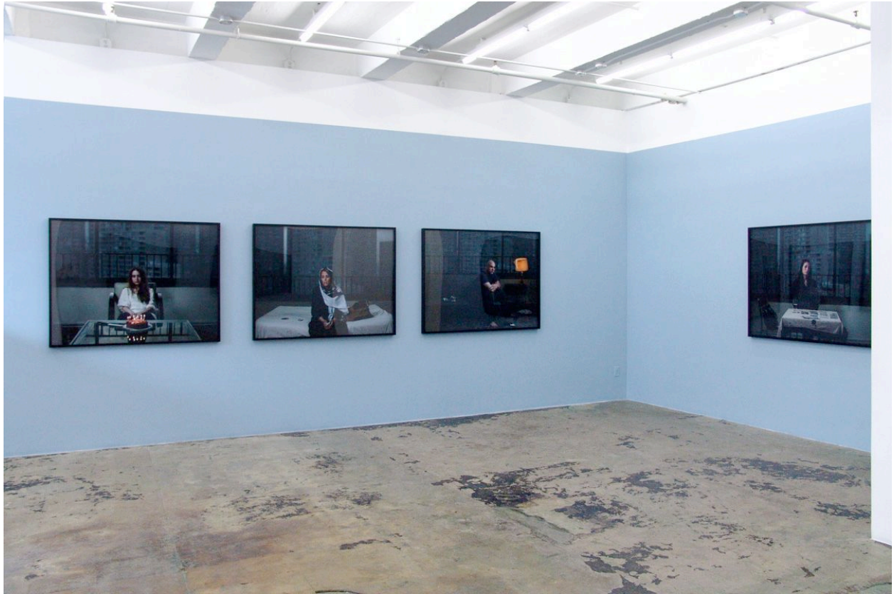
LOOK , solo exhibition at Thomas Erben Gallery April 11 - May 11, 2013 Installation view towards east and south wall