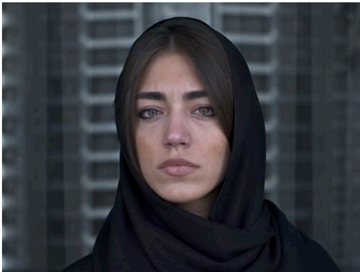
Look (2012) Inkjet print, edition of 7 (+2 AP) 41 x 55 inches

Thomas Erben Gallery 526 West 26 th Street, 4 th floor New York, NY 10001 www.thomaserben.com info@thomaserben.com