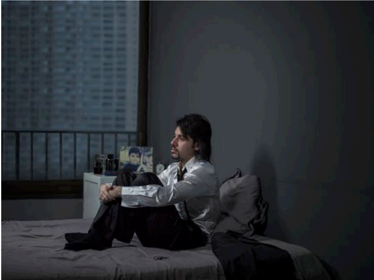
Look (2012) Inkjet print, edition of 7 (+2 AP) 41 x 55 inches

Thomas Erben Gallery 526 West 26 th Street, 4 th floor New York, NY 10001 www.thomaserben.com info@thomaserben.com