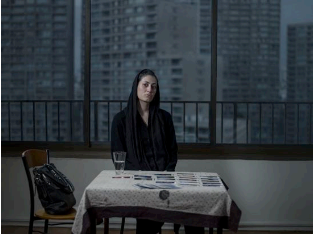
Look (2012) Inkjet print, edition of 7 (+2 AP) 41 x 55 inches

Thomas Erben Gallery 526 West 26 th Street, 4 th floor New York, NY 10001 www.thomaserben.com info@thomaserben.com