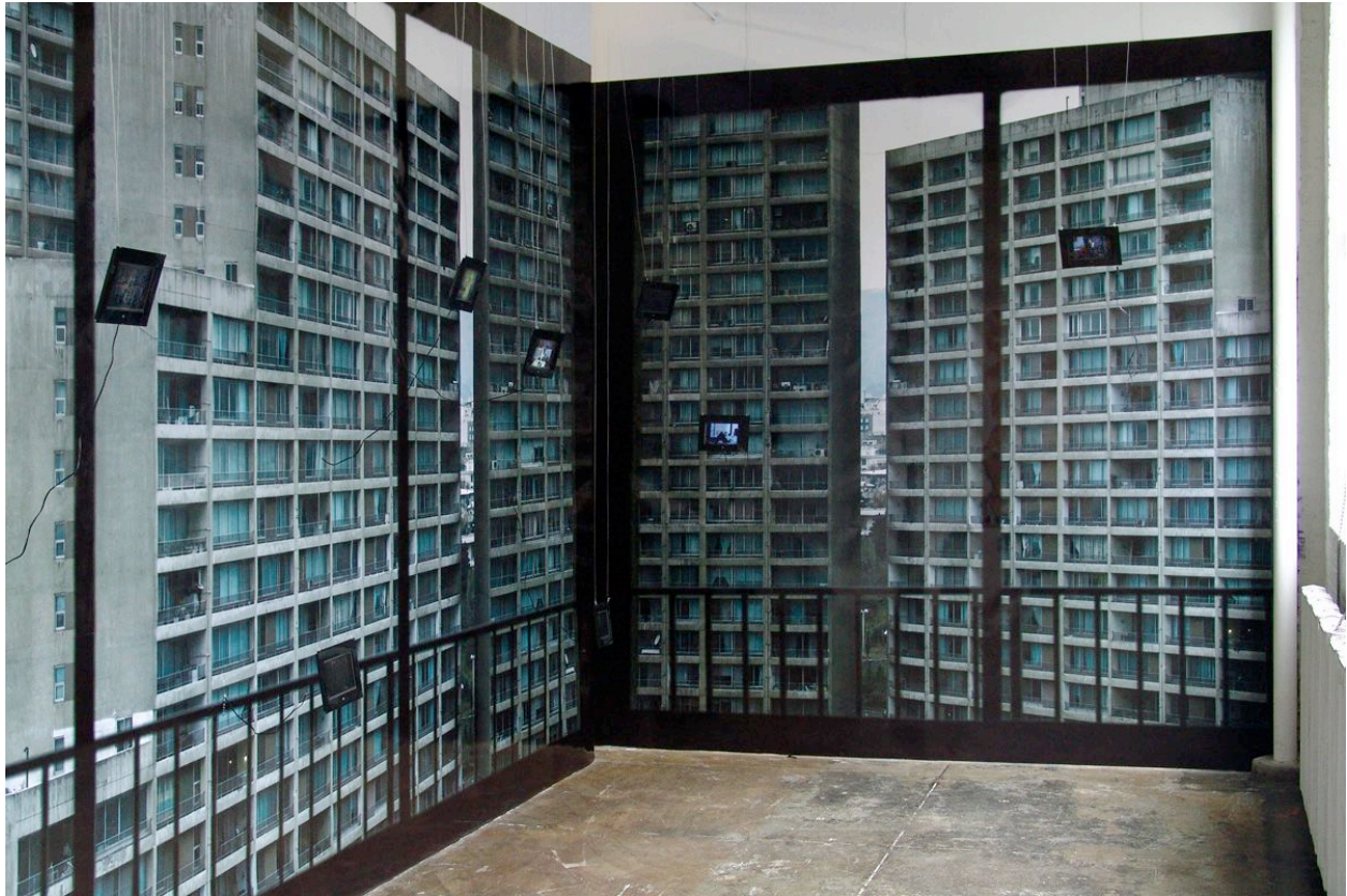
LOOK , solo exhibition at Thomas Erben Gallery April 11 - May 11, 2013 Installation view, project space Multi-media installation. Design by Arash Sadeghi L N.