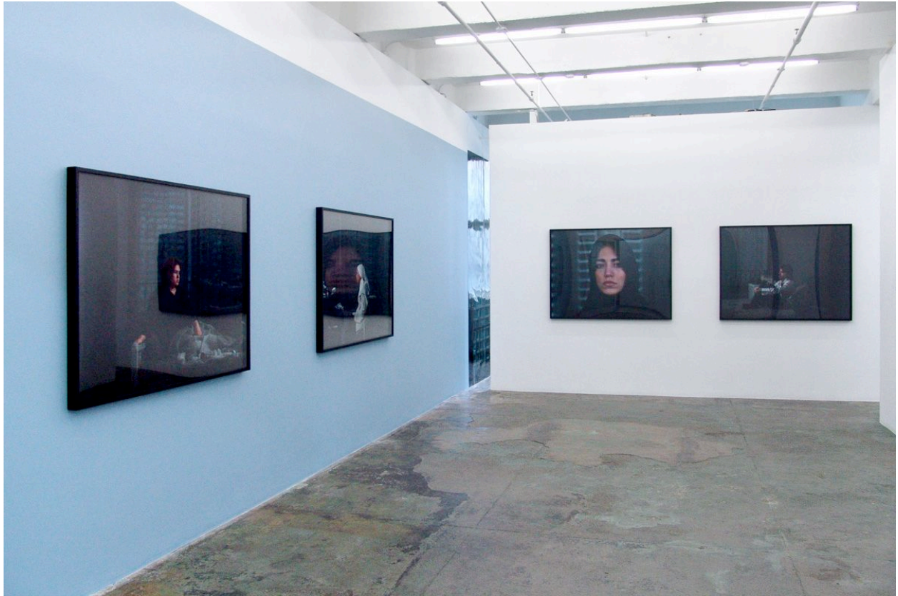
LOOK , solo exhibition at Thomas Erben Gallery April 11 - May 11, 2013 Installation view towards west and north wall