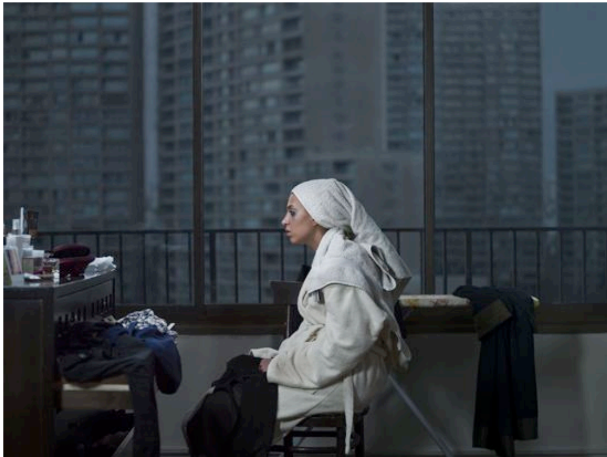
Look (2012) Inkjet print, edition of 7 (+2 AP) 41 x 55 inches

Thomas Erben Gallery 526 West 26 th Street, 4 th floor New York, NY 10001 www.thomaserben.com info@thomaserben.com