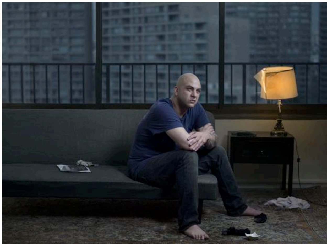
Look (2012) Inkjet print, edition of 7 (+2 AP) 41 x 55 inches

Thomas Erben Gallery 526 West 26 th Street, 4 th floor New York, NY 10001 www.thomaserben.com info@thomaserben.com