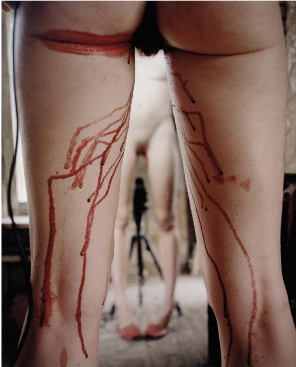
Untitled, 2025 C-print Edition of 5(+1 AP) 17 x 13.5 in.