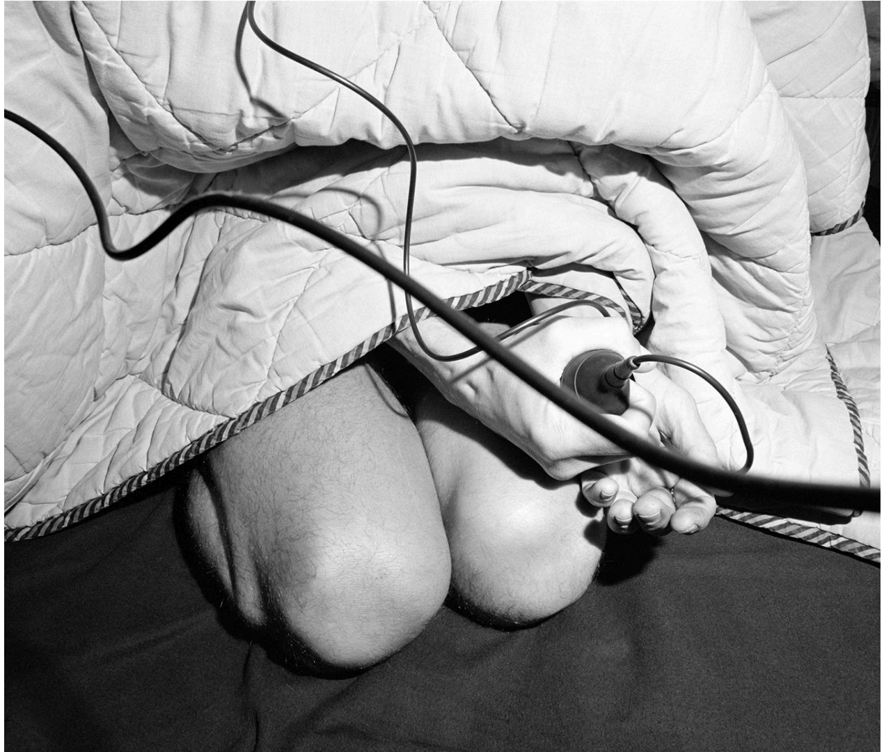
Untitled, 2025 Silver gelatin print Edition of 5(+1 AP)