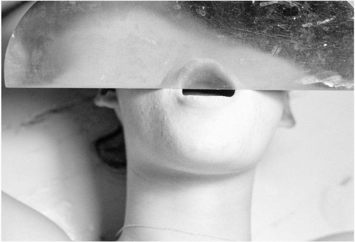
Untitled, 2026 Silver gelatin print Edition of 5(+1 AP) 11 x 15 in.