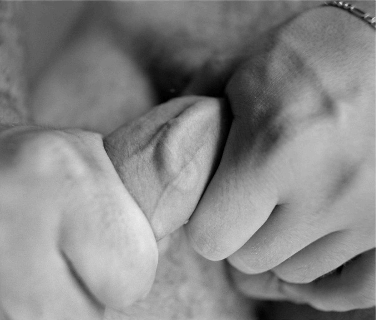
Untitled, 2025 Silver gelatin print Edition of 5(+1 AP) 13 x 15.5 in.