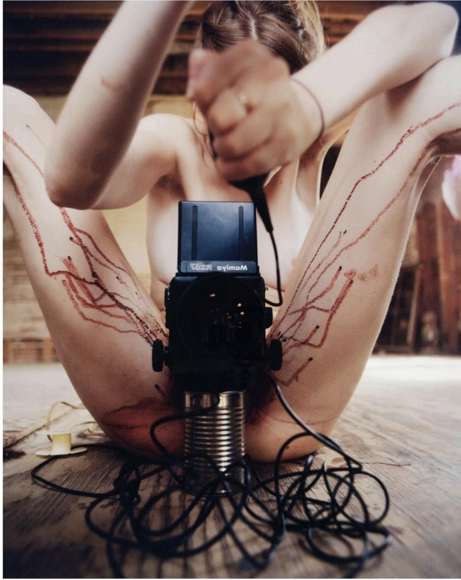
Untitled, 2025 C-print Edition of 5(+1 AP) 17 x 13.5 in.