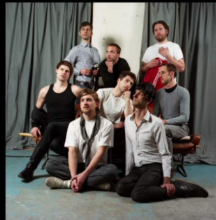
02 An image I could not have taken alone.

NINA HOFFMANN/KATHRIN SONNTAG First two pairings from Ein Bild (An Image) , 2015 Slide projection / HD digital projection dimensions variable Edition of 3 + 1 AP