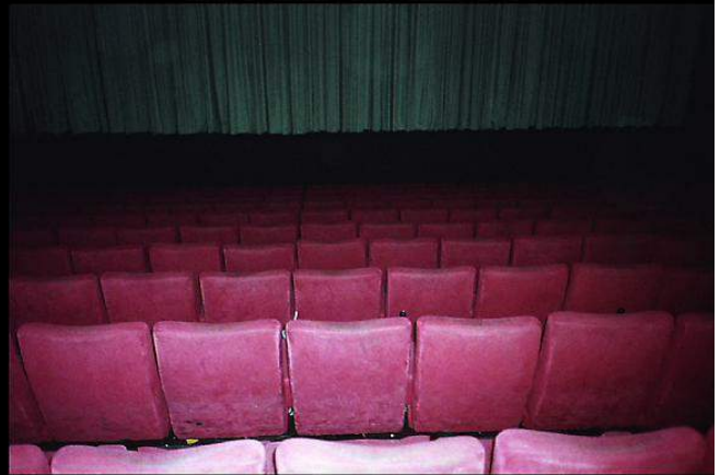
01 An image where I was all alone