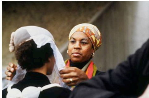
Clockwise from upper left: Studio Performance with R.S.V.P. 1976, Study for Mesh Mirage, 1977, Freeway Fets, 1978