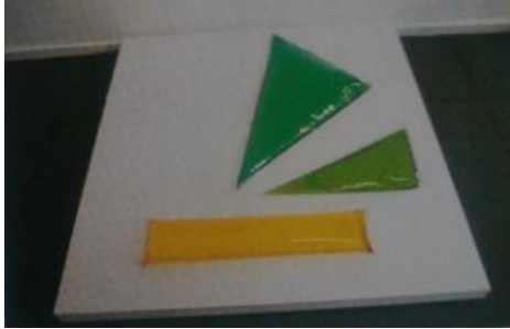
Water Composition IV (1970)