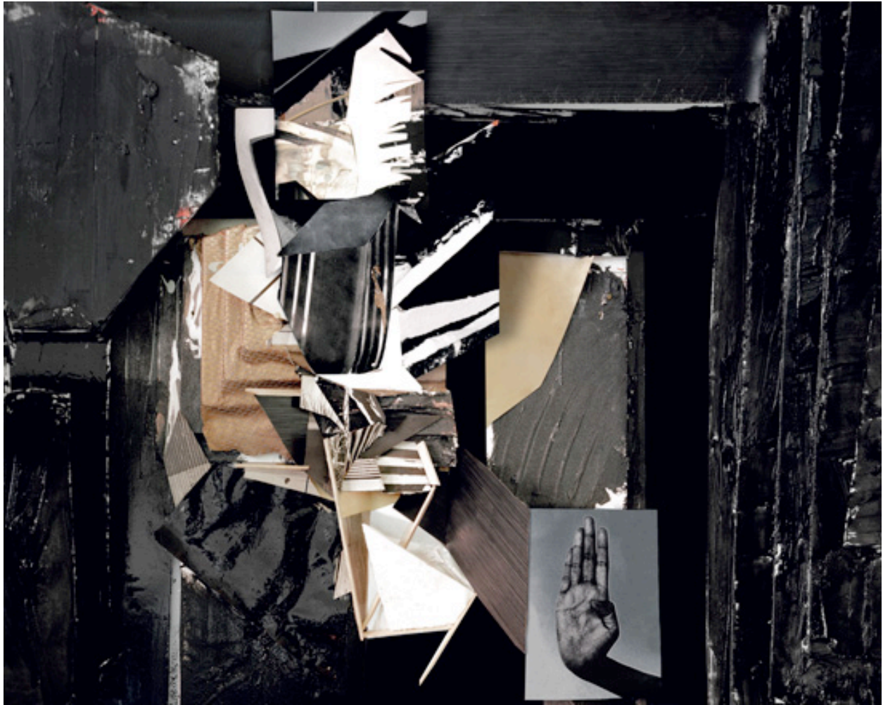
Past Present , 2013. C-print, 40 x 50 in, edition of 5 (+2 AP).

Process and temporality have always been essential to Nayar's work: tabletop and wall-built models are fashioned from raw industrial materials and studio debris, and continuously reworked while being documented by the camera. The works in an axe for a wing-bone seem even more impermanent than earlier examples, unhinging meaning/logic in a classic surrealist clash of visual impulses, where multiple perspectives are contained within the same image. Constructions that previously appeared fractured but stable have been infused with a heightened precariousness, the delicate energy of a place whose very structure is founded on the constant shift of time and movement. There is a presence of body in these spaces, hands building and tearing apart, the physical and personal merging with the space itself as each small event leaves its mark.