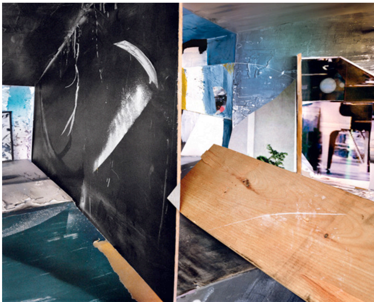
Head Over Heels , 2013. C-print, 40 x 50 in, edition of 5 (+2 AP).