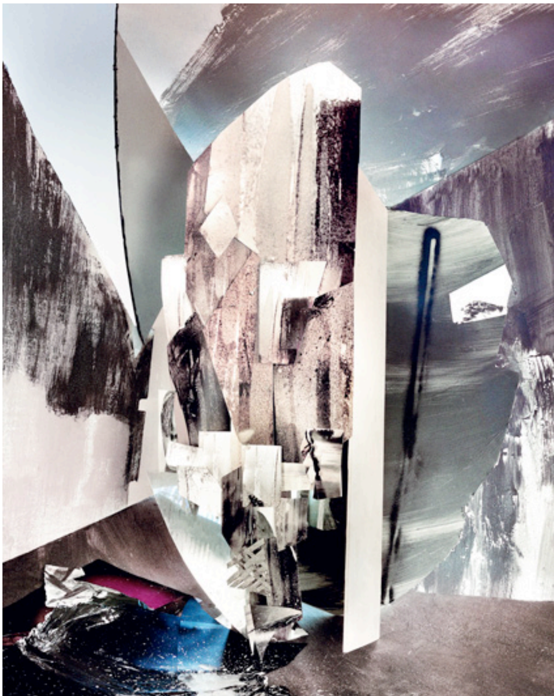
Akhet , 2013. C-print, 50 x 40 in, edition of 5 (+2 AP).