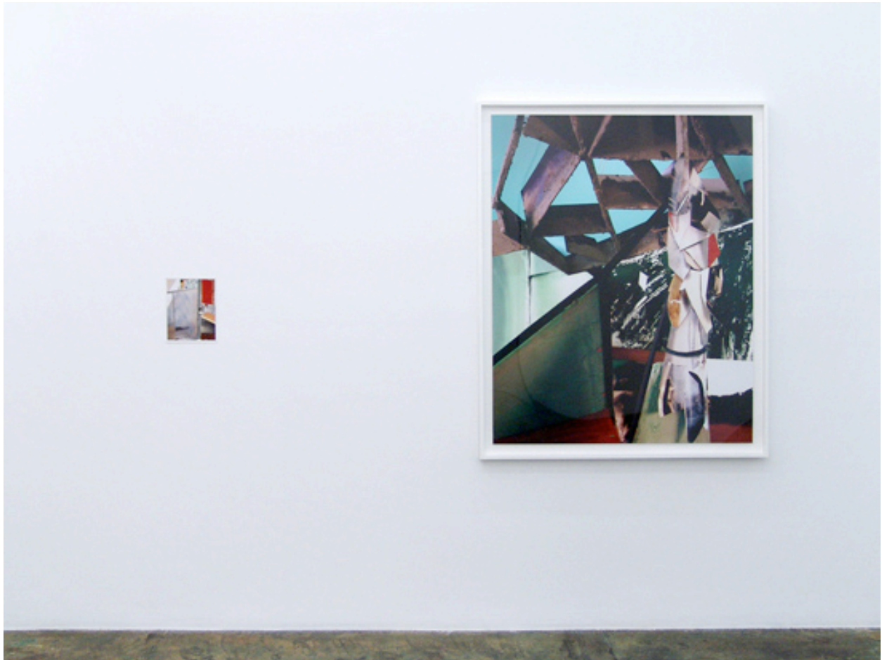
Chrysalis , 2013. C-print, diptych, 8 x 10 and 50 x 40 in respectively, edition of 5 (+2 AP).