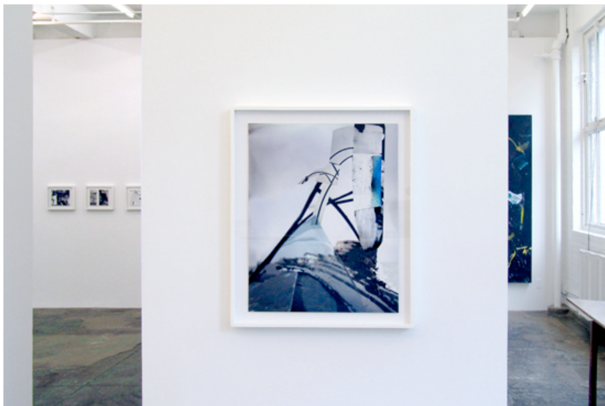
Installation view towards west wall.