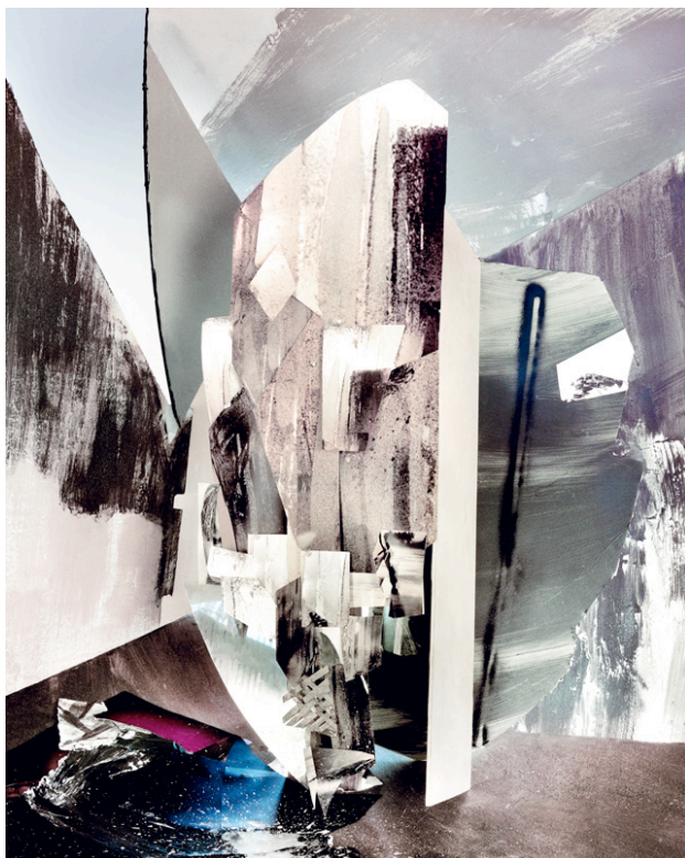
Akhet , 2013. C-print, edition of 5 (+2 AP), 50 x 40 in.