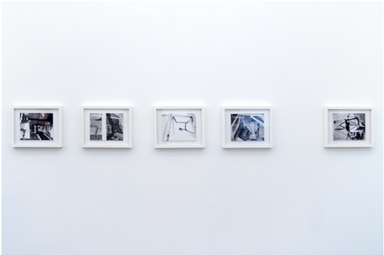
On Form and Growth , 2013. C-prints and felt-tip pen on C-print, series of 5, 8 x 10 in each, edition of 5 (+2 AP).