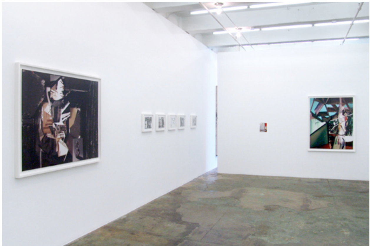
Installation view, west and north wall.