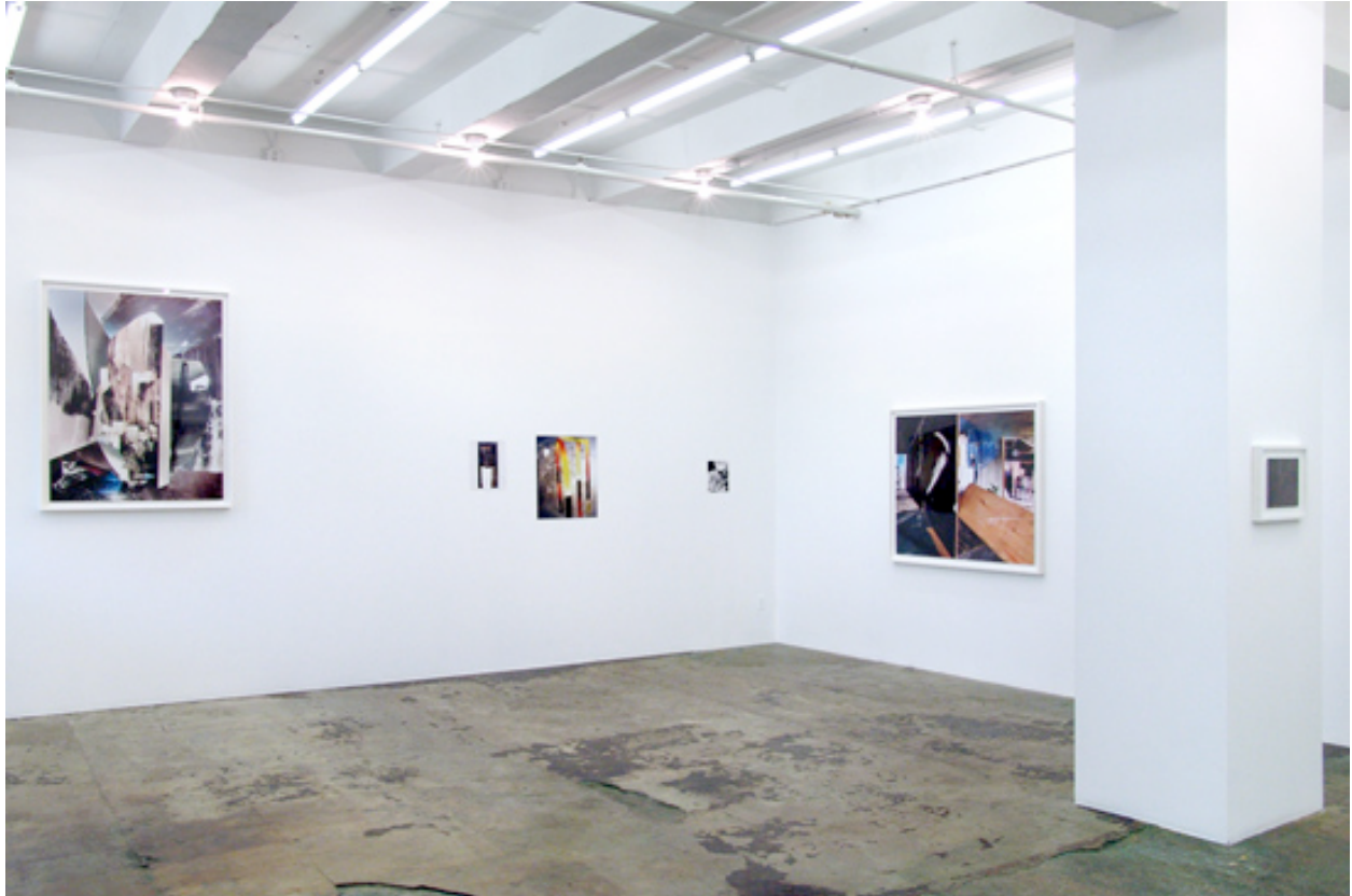
Installation view, east and south wall.