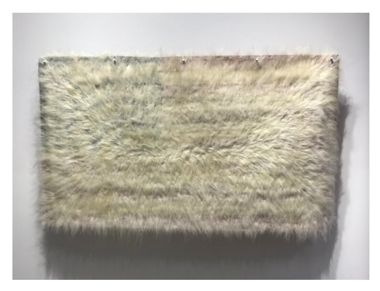
Sonya Kelliher-Combs, Mark, Polar Bear , 2019, acrylic polymer, polar bear fur, fabric flag, metal brackets, 40 x 65 in. ©2019 Sonya Kelliher-Combs. Image courtesy of the artist and Minus Space.

The key to ecofeminism(s) is often carefully directed critique executed as a type of magic. Much of the investigation is ritualized. The breaking of the screen into halves and quarters in Carla Maldonado's Dystopia of a Jungle City, and the Human of Nature (2019), mirrors and refracts images of indigenous life on the Amazon and gently heightens the words of the interviewees and the dysfunction of Bolsonaro's cruel actions against them. Agnes Denes catalogs the three iterations of her Rice/Tree/Burial: Preparations for the Rice Field with Irrigation System (1977/2020); Chaining the Sacred Forest (1977/2020); Burial of the Time Capsule (1979/2020), in sets of six photographs—aiming for journalistic veracity combined with the mystic and medieval storytelling methodology of a set of panel paintings of a saint's life and miracles.