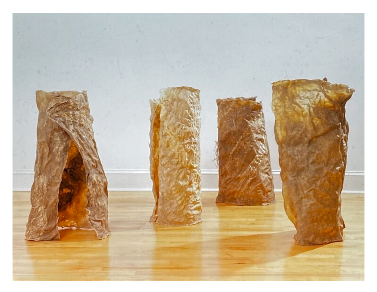
Bilge Friedlaender, Cedar Forest (detail), 1989, nine freestanding handmade linen paper sculptures, variable dims: 34 in.

Untitled (We Won't Play Nature to Your Culture) (1983), a catalog cover for Kruger's exhibition of the same name, and Climate Change is Real (Multiple) (2017), a neon sign edition by Bowers.